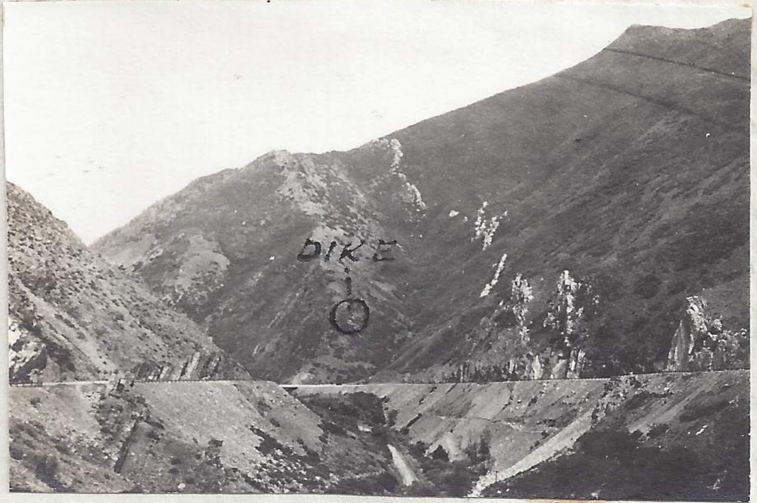
3-6-3-39 (Pic copy )

Geology class took trip to Salt Lake City to inspect the paleontological collection at the University of Utah and to study the geology from City Creek south to Little Cottonwood Canyon. Recorded one picture, 3-6-3-39 showing the contact between the Permian and the Triassic. Collected a Blue racer, 1-6-3-39 at mouth of dry Canyon. S. L. Co., below the Bonneville level among chert, grass, sage, oak and bunch grass. In this canyon we found contact of the Park City's Woodside formations. Also observed a mourning dove nest on west exposure without surrounding protection of any kind. 2 eggs. bled near. Collected a Pituophis, 2-6-3-39 c. d. 4