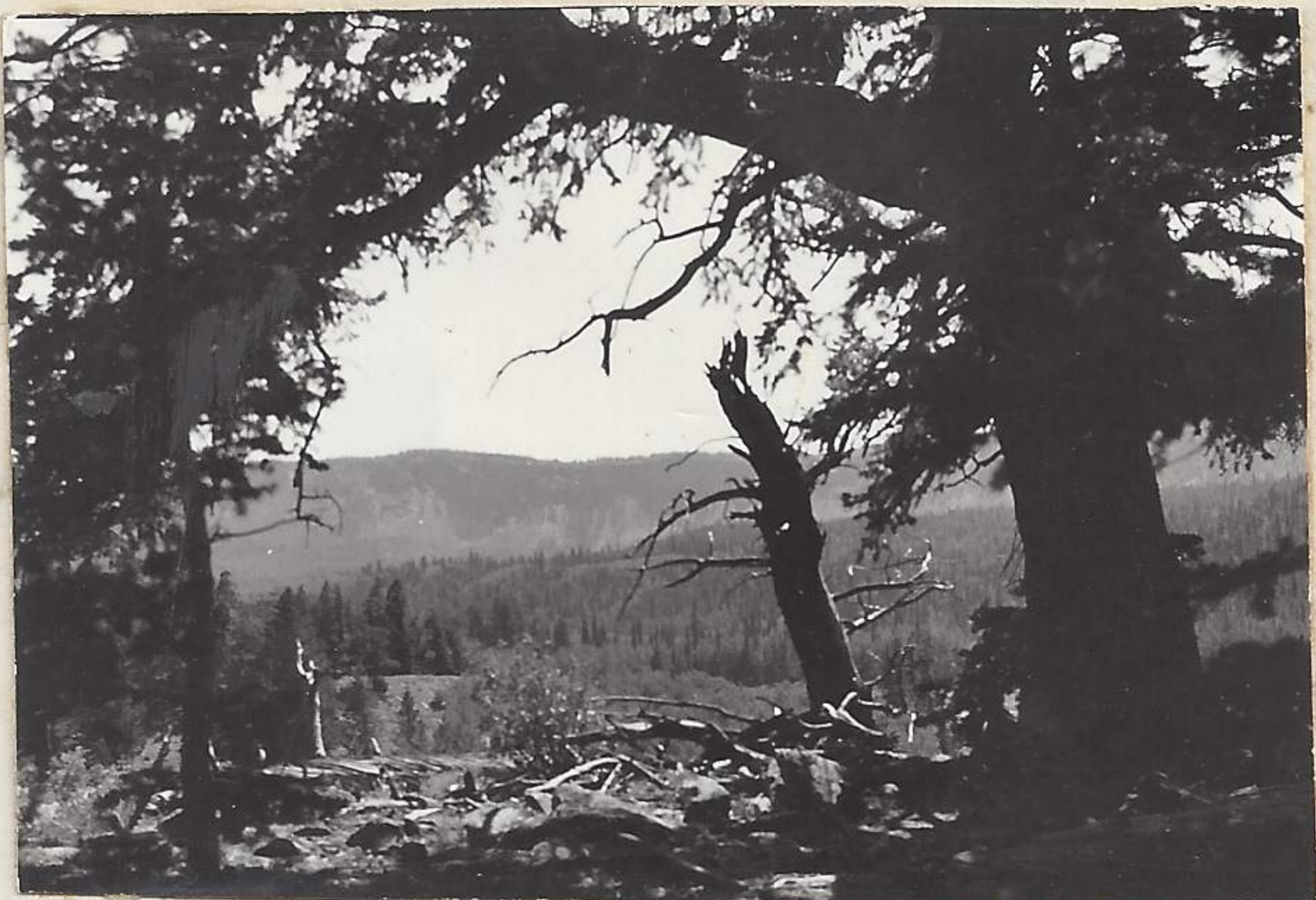
1-9-8-37 Along trail. Donkey Lake at base of lava cap in distance.