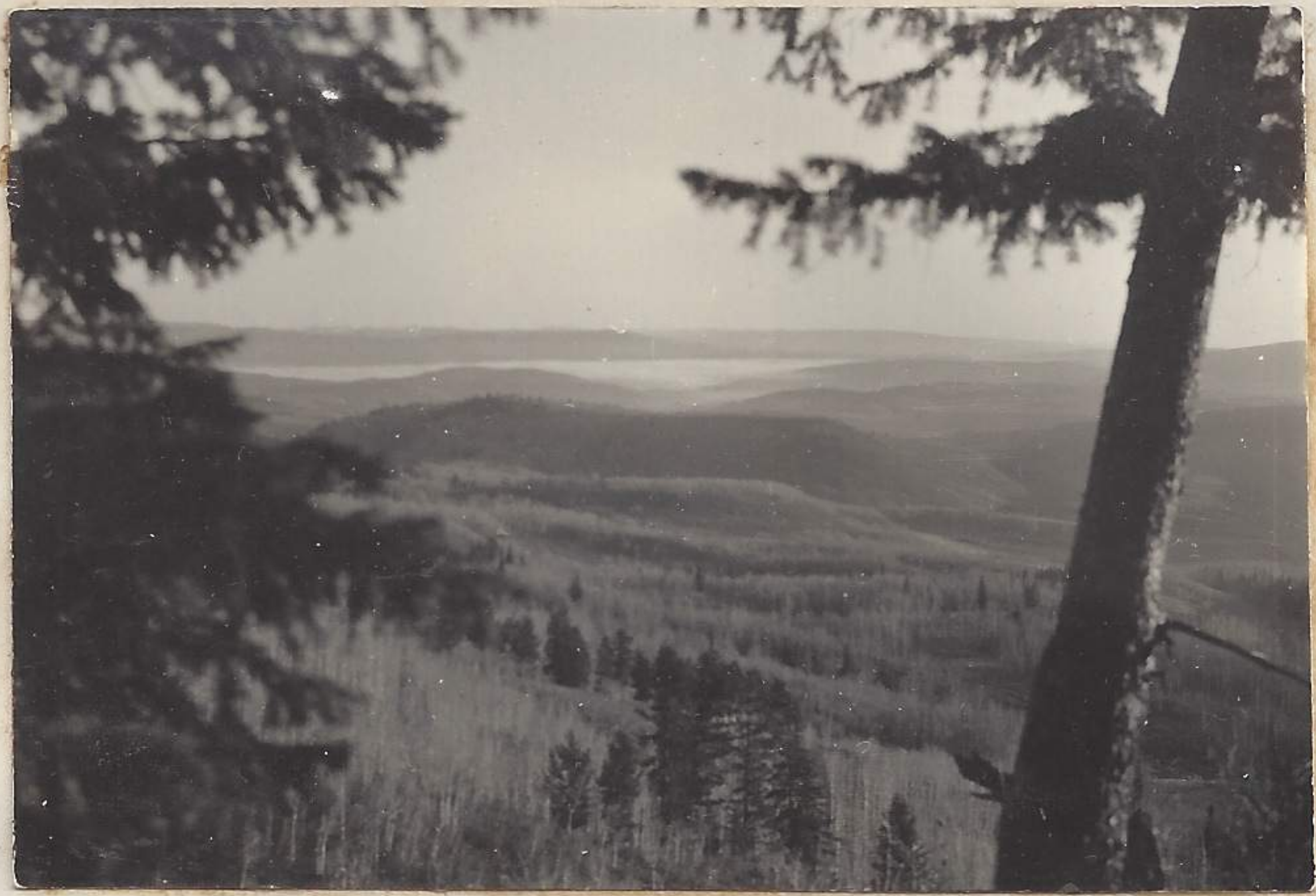
3-10-20-37 View to north from low sheep peak. Strepaper Creek and cloud shrouded Strawberry in distance