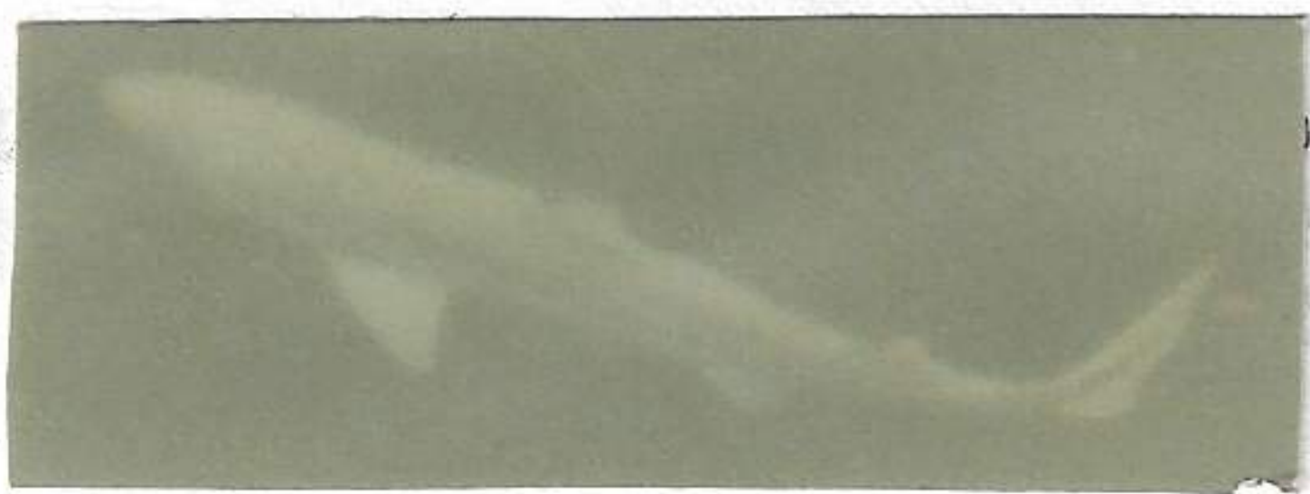
Photo 870921-5 of a shark approx. 4' long.

Photo 870921-4 of red berries of the madrona. These berries change red from a green color.