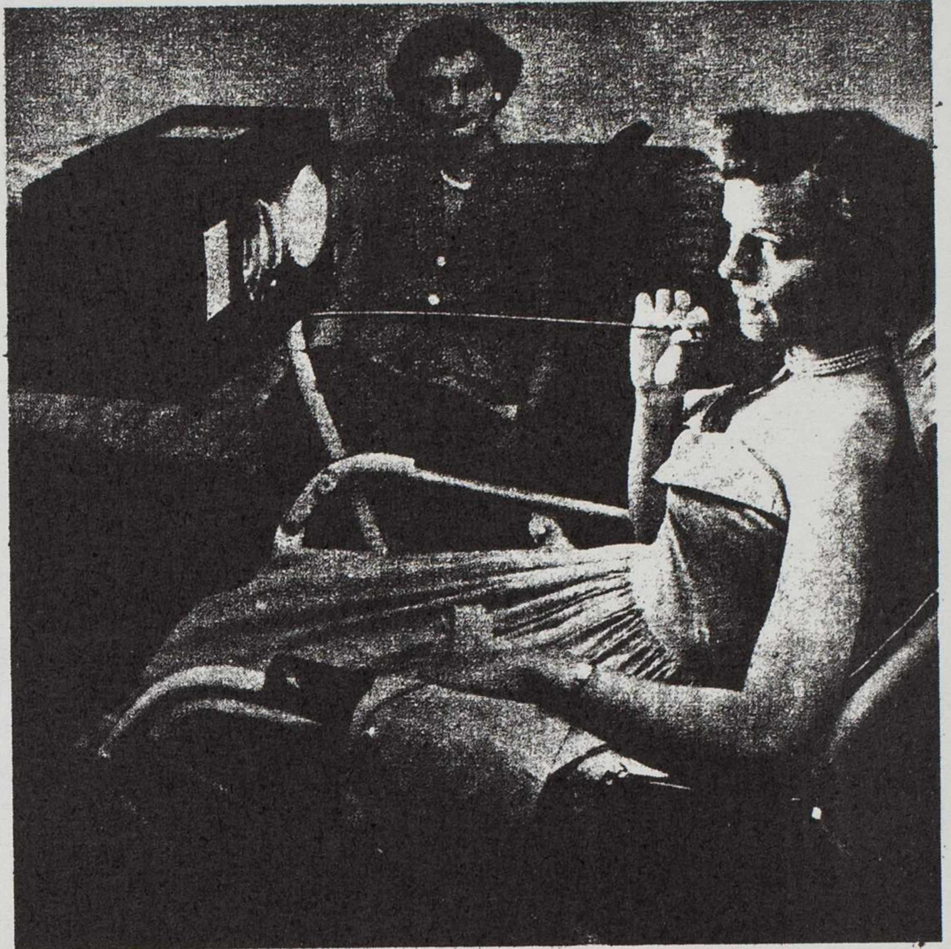
ABOVE: Mrs Pontex demonstrates new weightless cosmetic radio device, neighbor lady looks on; BELOW: a branch of renegade Wunties in bocar.