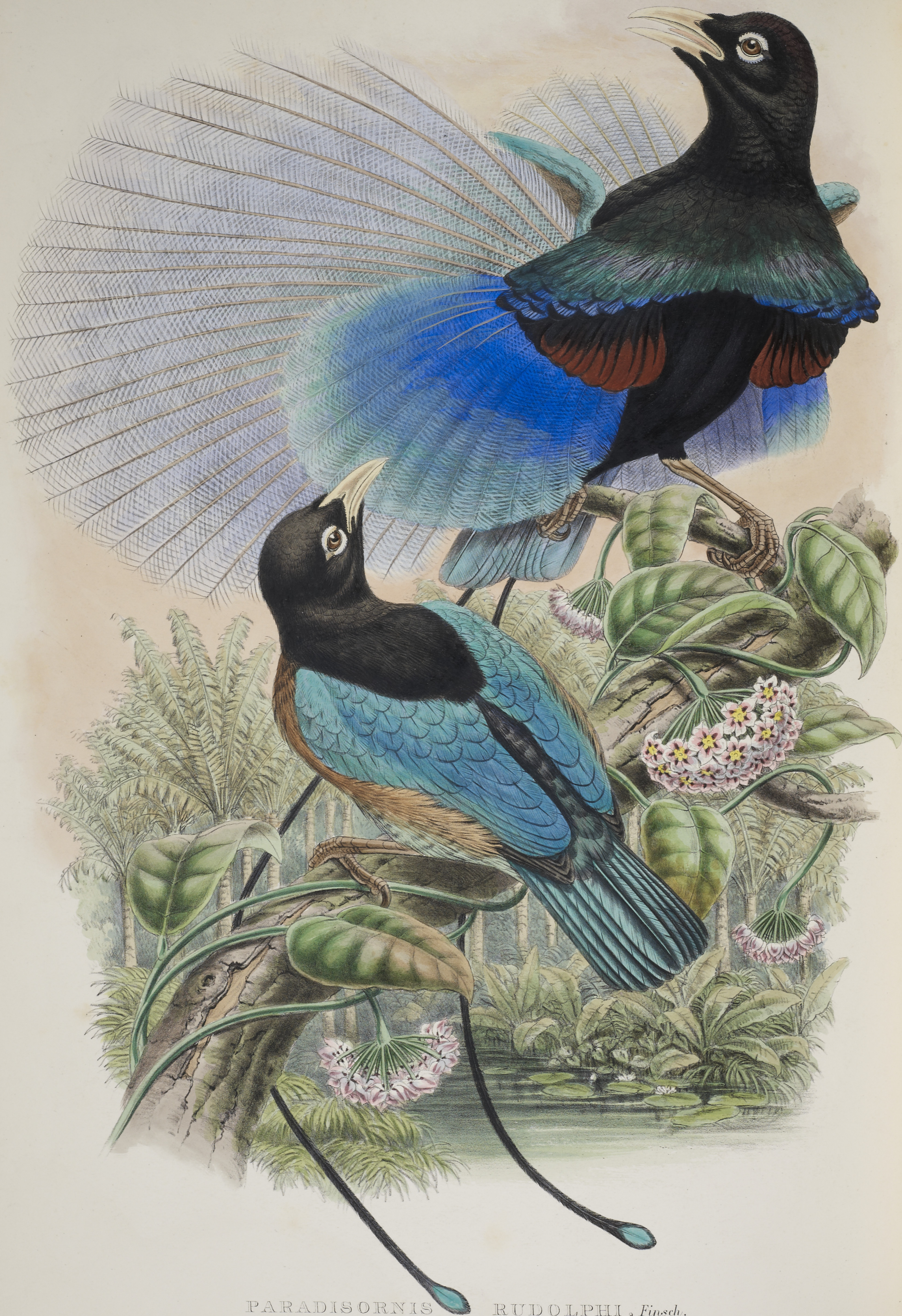
PARADISORNIS RUDOLPHI, Finsch.