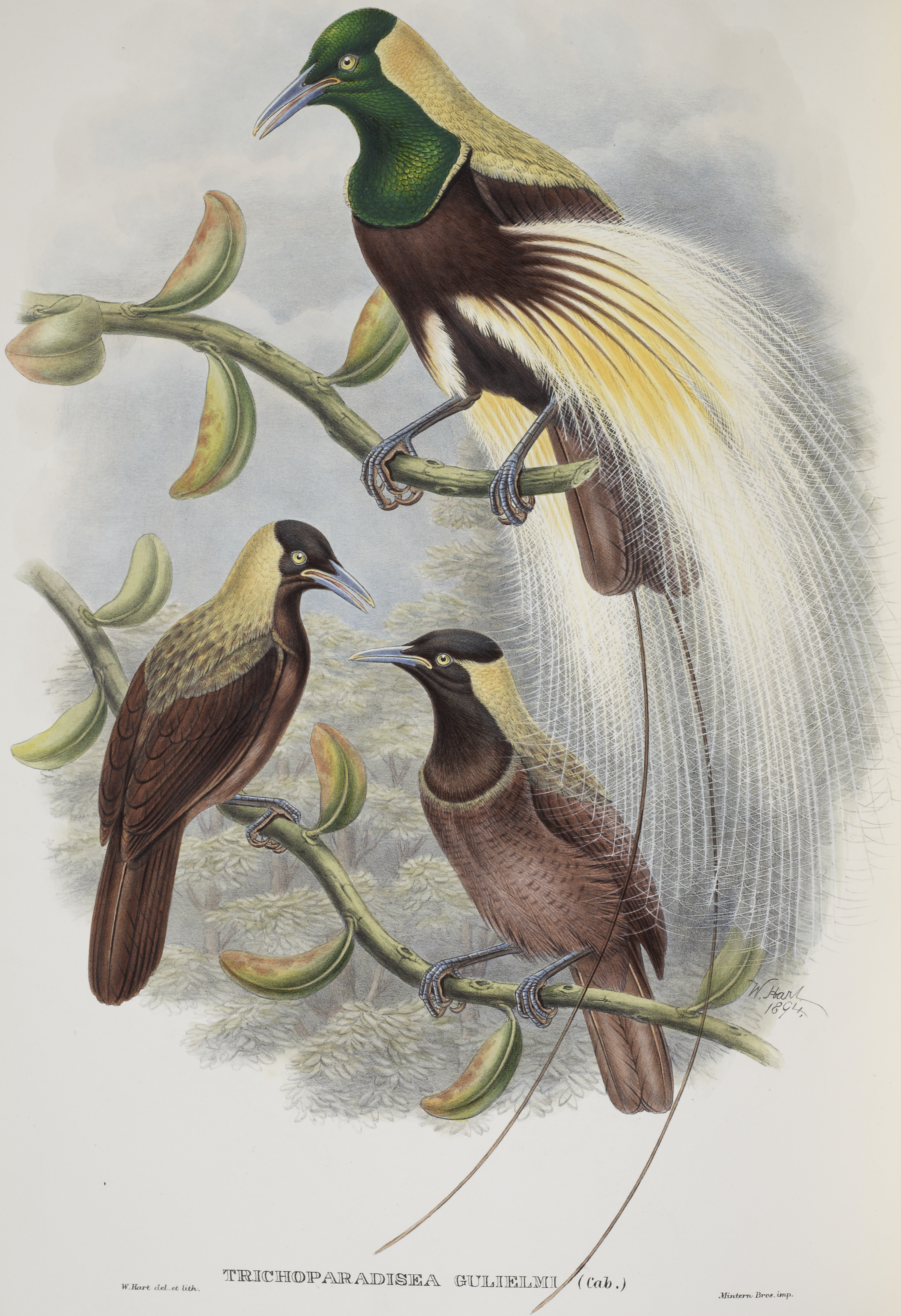
TRICHOPARADISEA GULIELMI (Cab.)