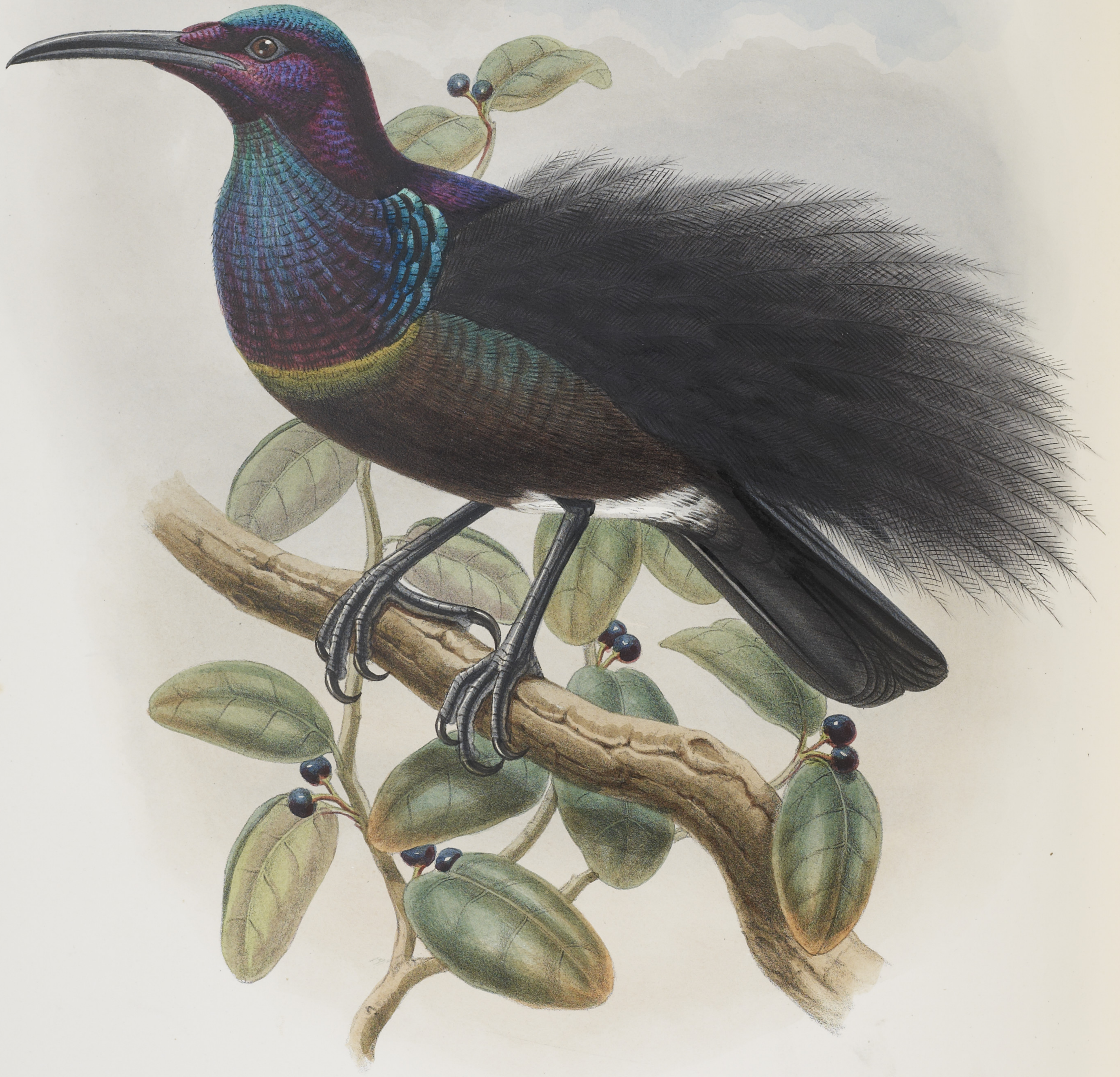
CRASPEDOPHORA MANTOUI, Oustalet .