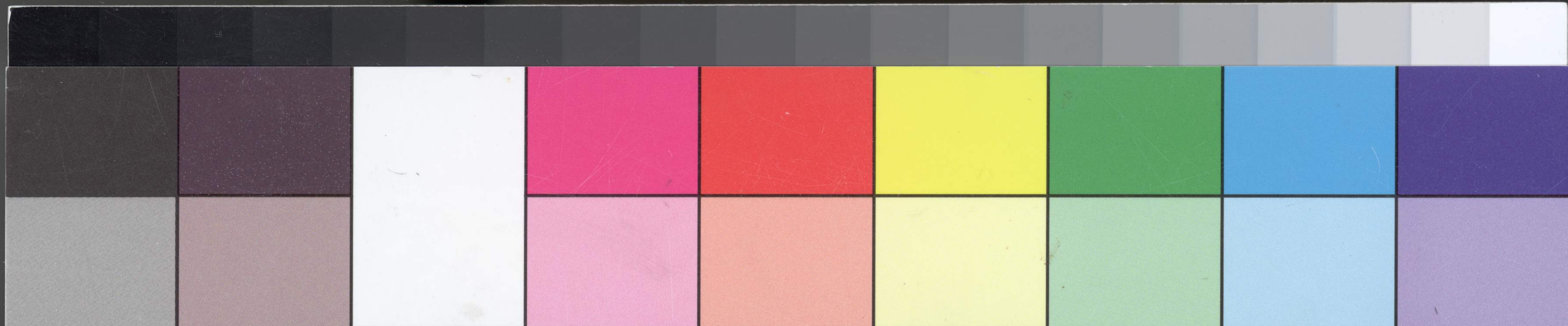
Black 3/Color White Magenta Red Yellow Green Cyan Blue

The LeCompton Constitution is in a critical condition, and it is very doubtful whether it will pass. My opinion is, Calhoun will not grant certificates of election to the Democratic members from this county. If he should, we cannot sustain the party and sustain the Delaware election frauds, They are too palpable and glaring