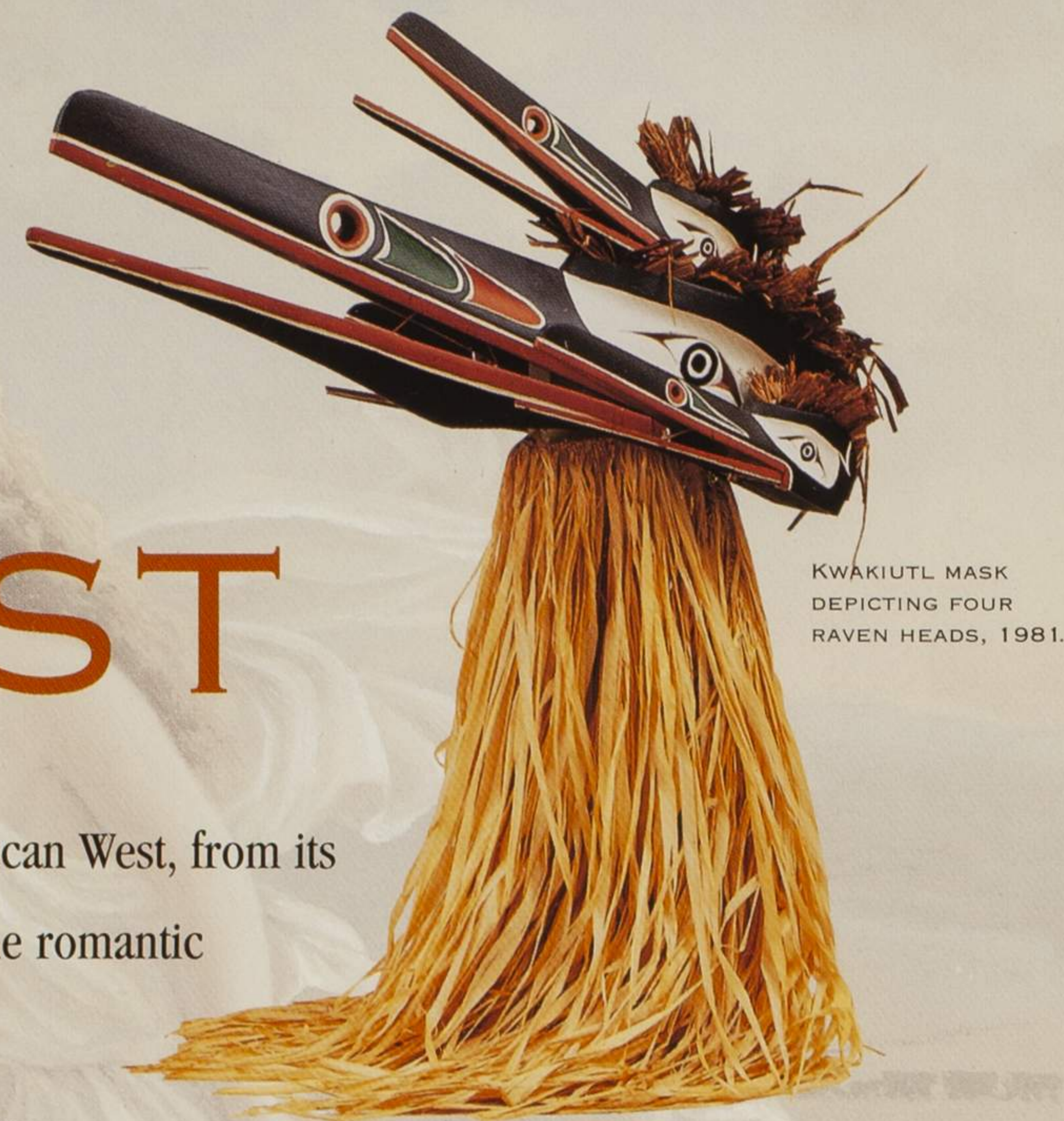
KWAKIUTL MASK DEPICTING FOUR RAVEN HEADS, 1981.

Built with a $54-million gift from the Autry Foundation, the museum is a distinctive, world-class center. It is the only museum to so broadly span the West's temporal, geographic, and artistic scope. Its collection of significant, artistic, and historical Western firearms is the finest in the country. In material related to the mythical West—film, radio, television, and advertisement—it is the best in the world. The Autry Museum, a non-profit, 501(c)3 public charity institution, opened in 1988.