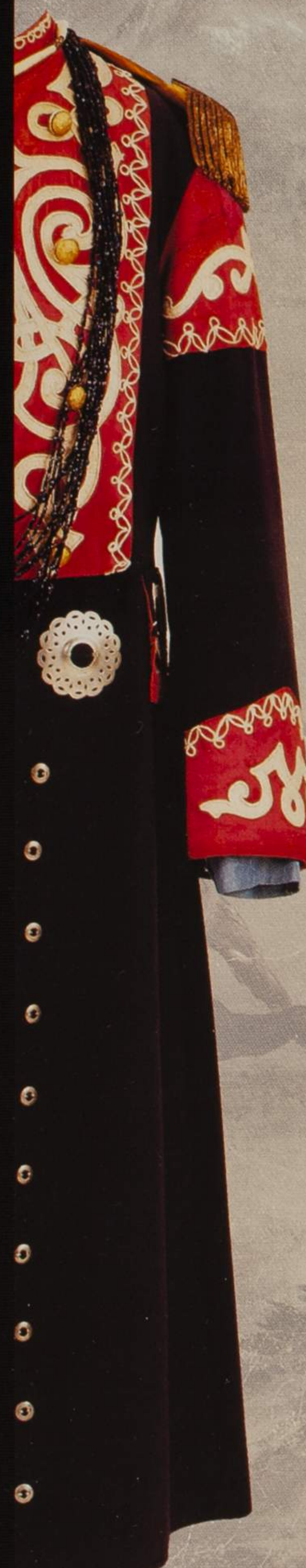
DETAIL OF OSAGE WEDDING DRESS, LATE 19TH CENTURY.