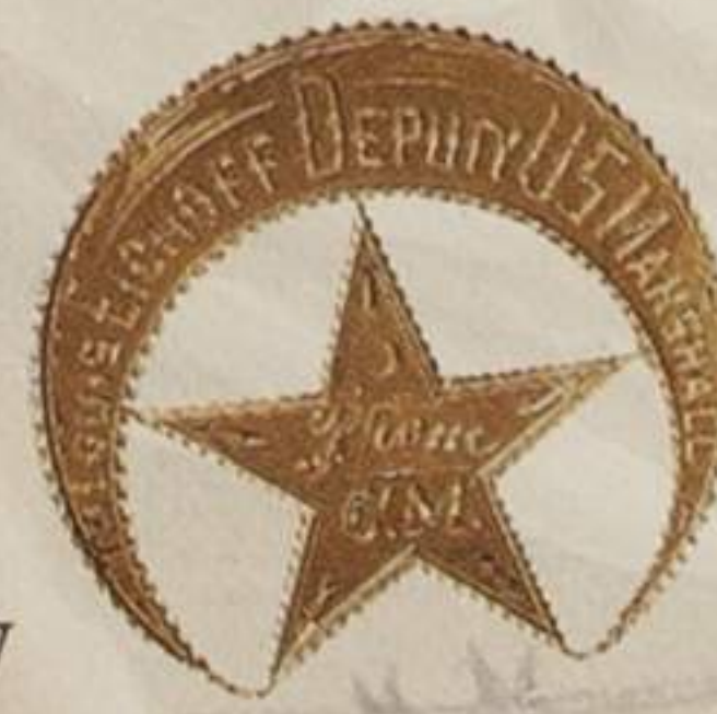
GOLD DEPUTY U.S. MARSHAL BADGE, ABOUT 1893.