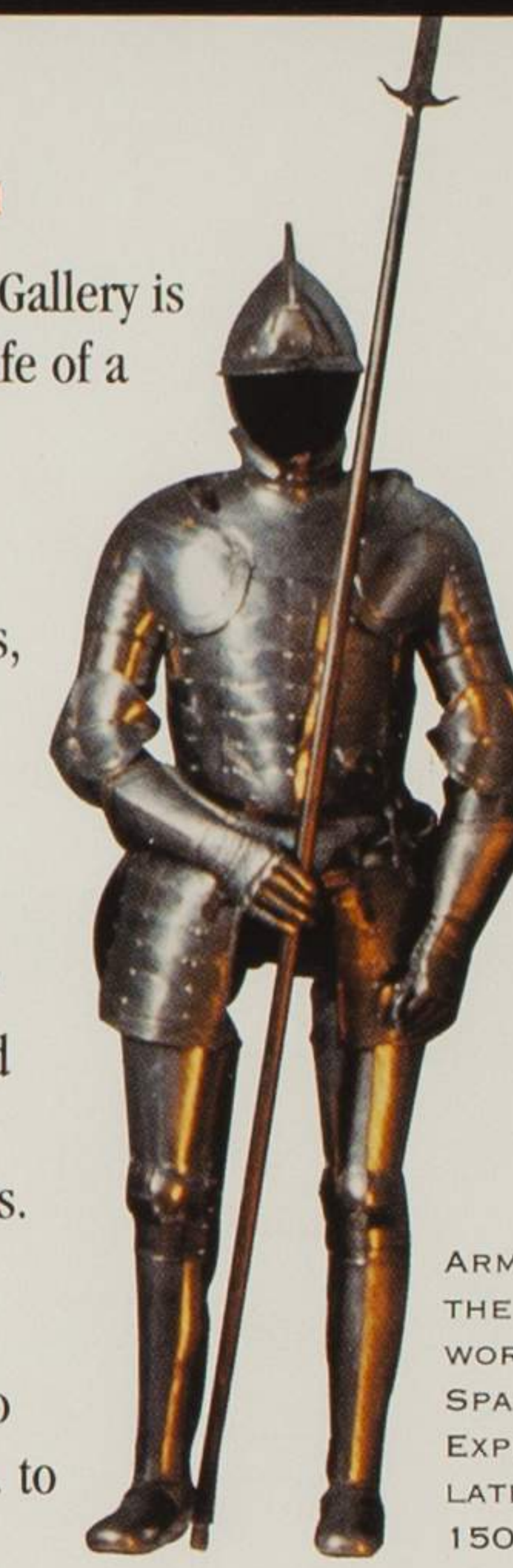
ARMOR OF THE TYPE WORN BY SPANISH EXPLORERS, LATE 1500S.