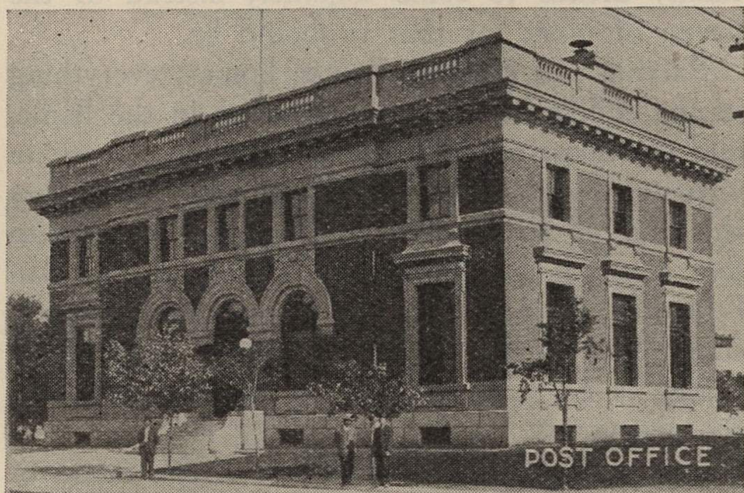
Federal Building, Mitchell

Good Food, Specialty Steaks, Chops and All Kinds of Salads and Lunches Mitchell, South Dakota