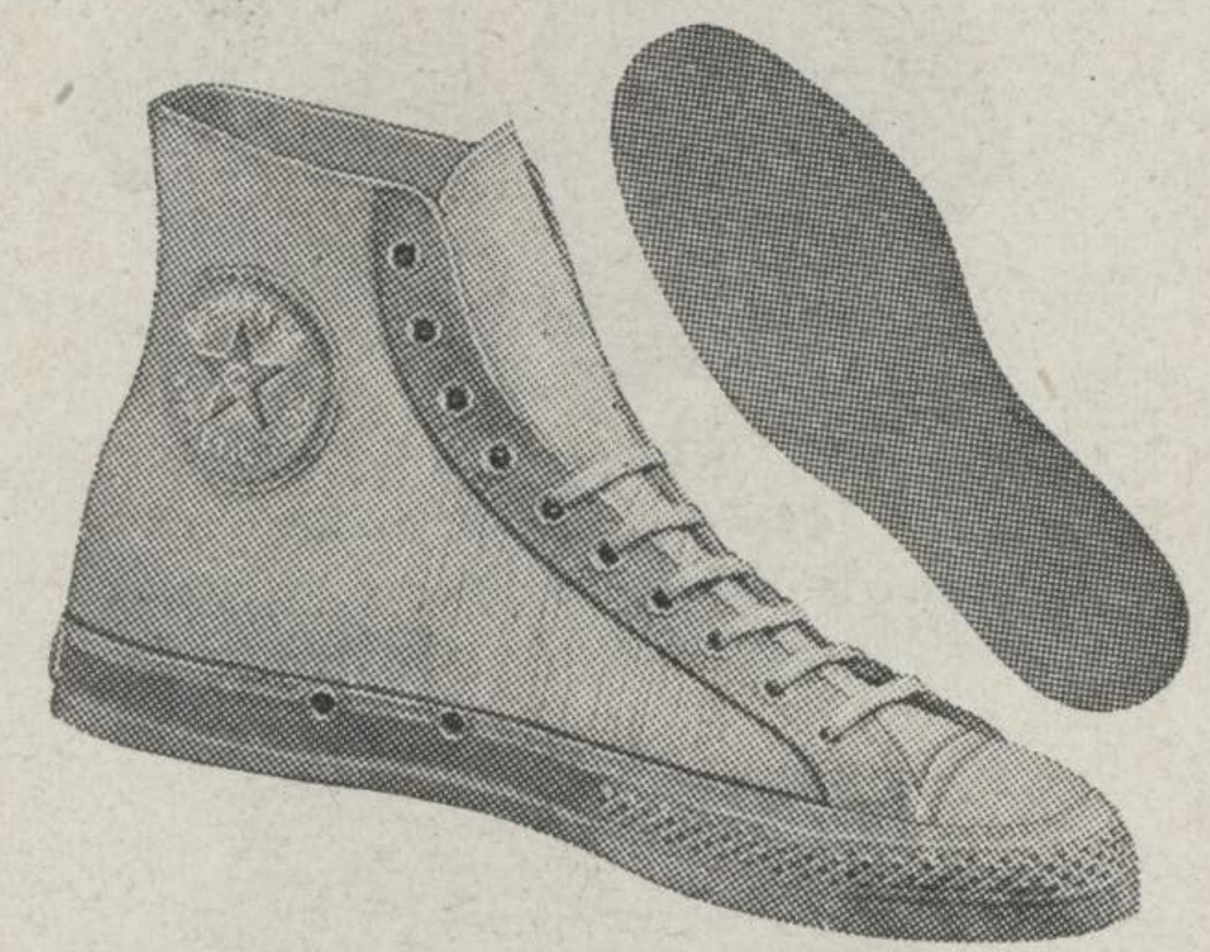
No. L9000—Girls' "All-Star"