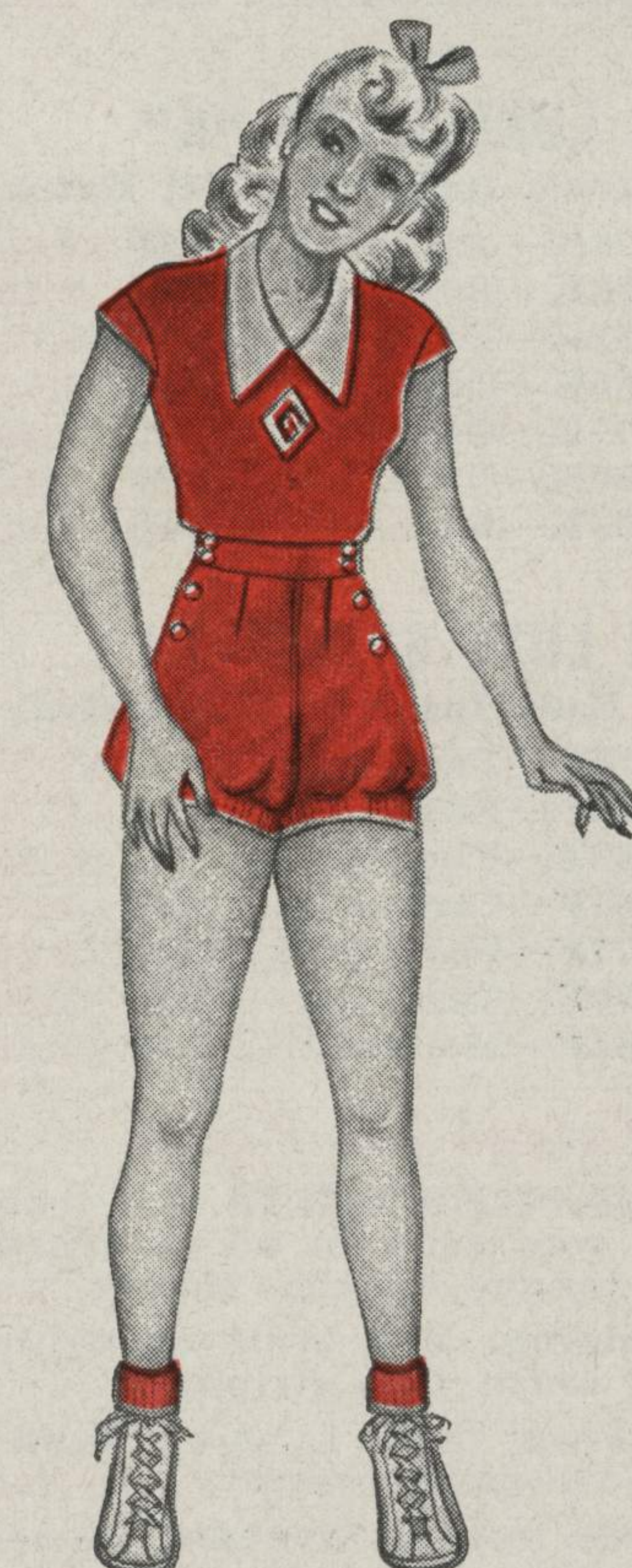
No. B810—Shirt No. W56—Shorts