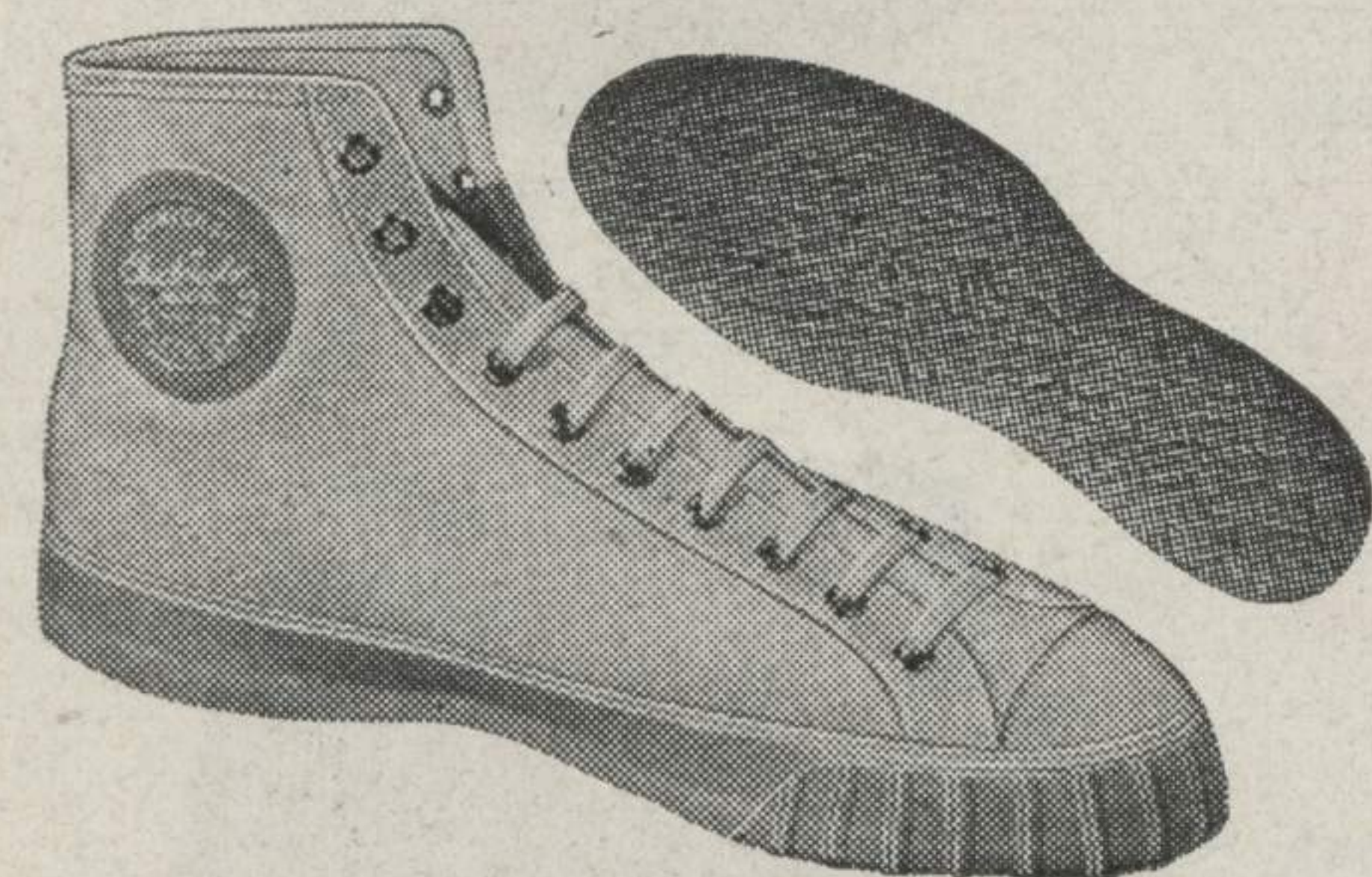
No. L9240—Girls' "Pro" Shoe