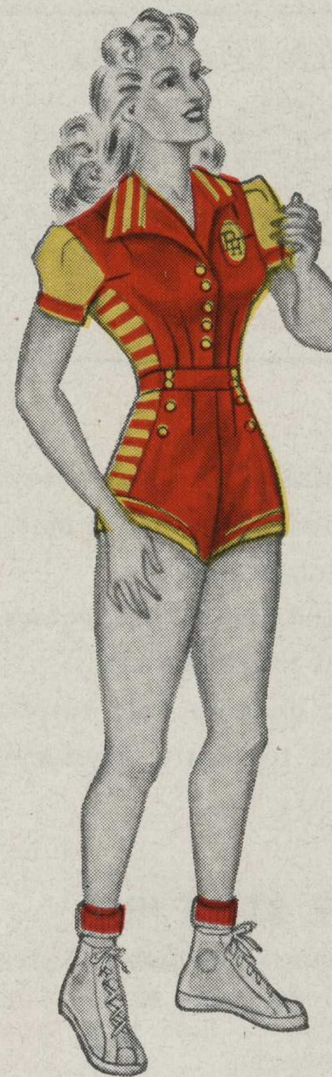
No. B820—Shirt No. W57—Shorts