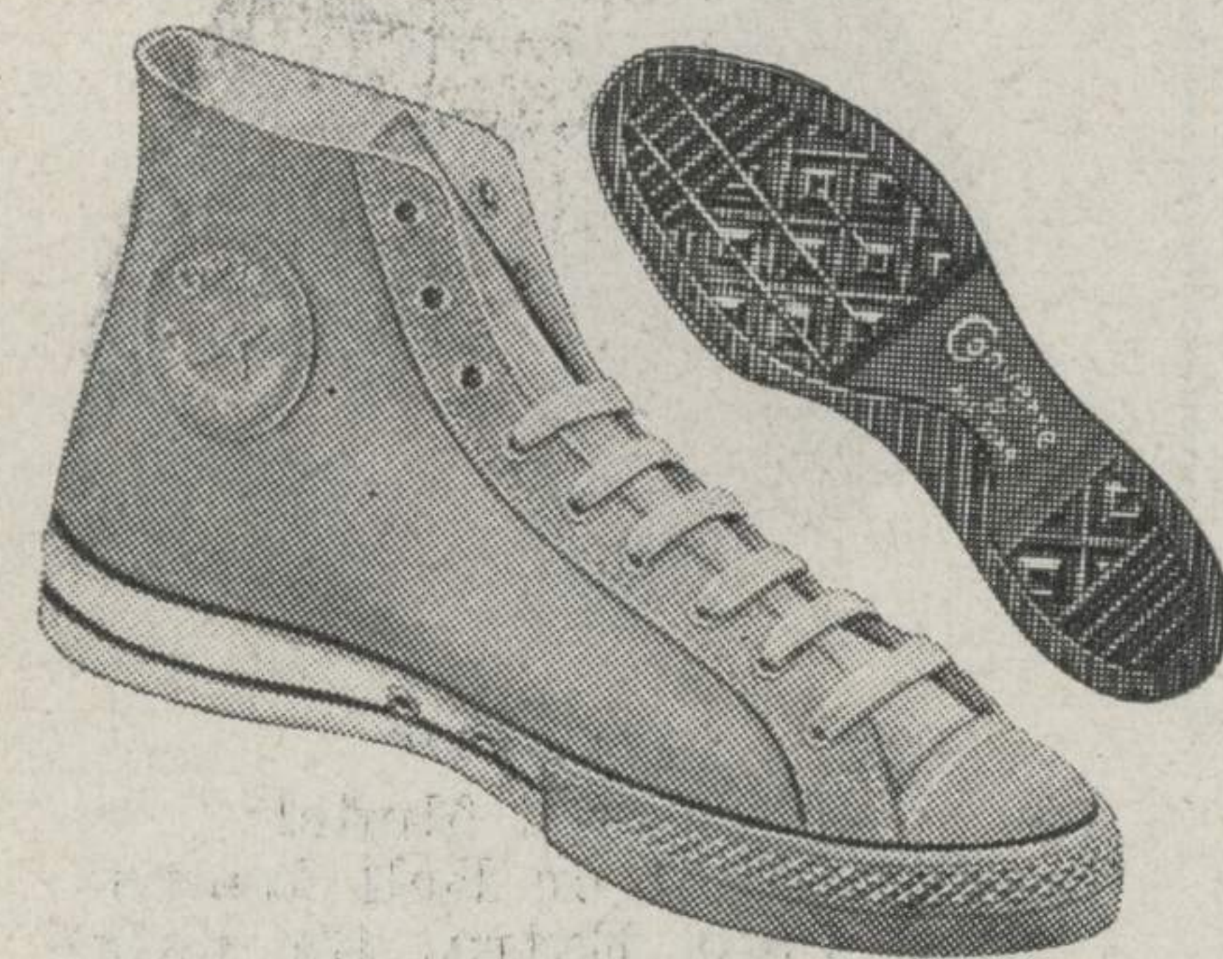
No. L9014—Olympic "All-Star"