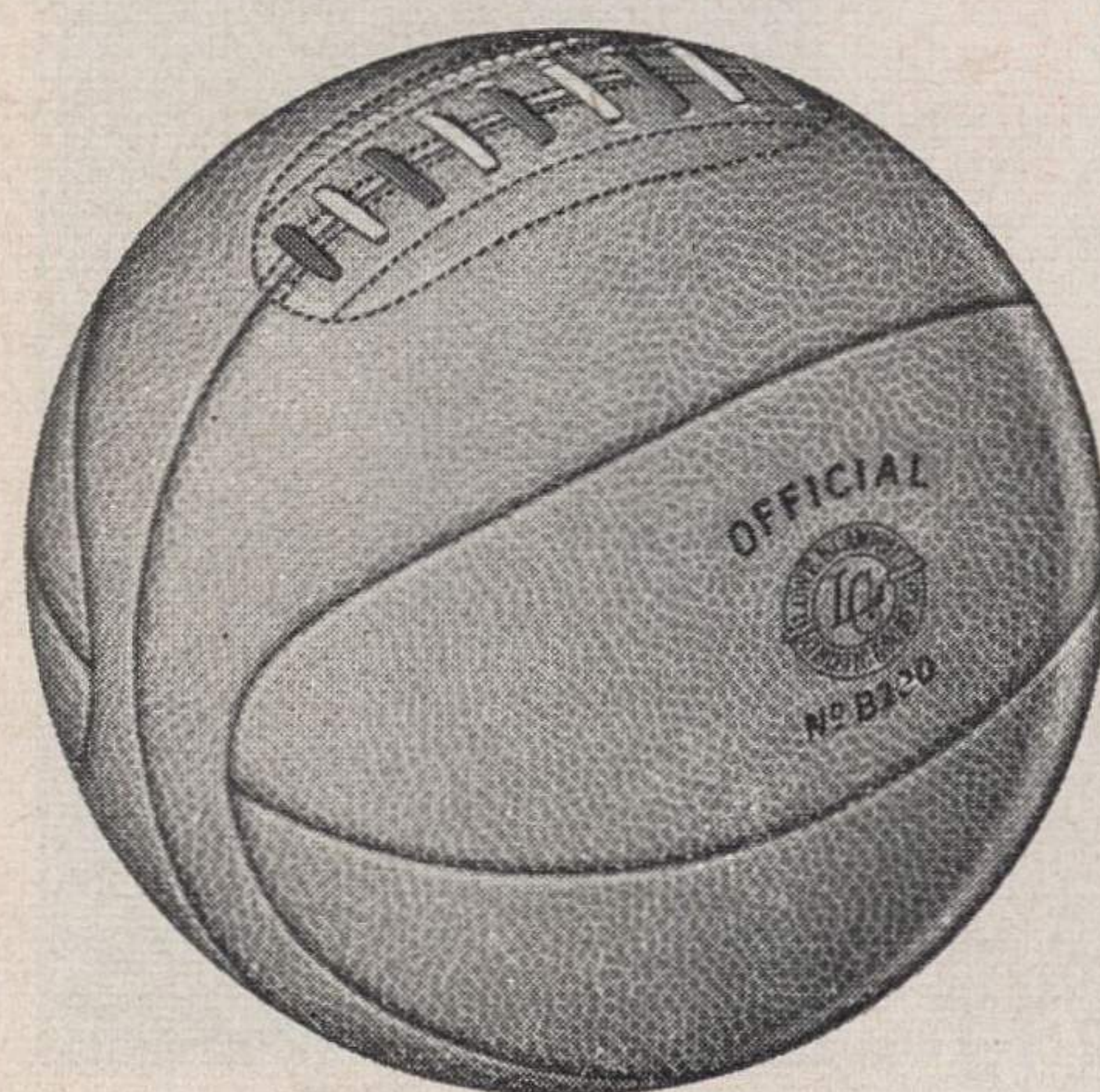
No. B220—"Double Laced" Ball

No. B220—Official basket ball of the finest selection of specially tanned cowhide, made on the minimum circumference of the official rules. Perfect roundness is guaranteed by the double cross tension lining that eliminates all stretch and the weight of the flush double lace is compensated for by the patented leak-proof rubber valve on the opposite side. A top-notch ball that removes all worry of repair. Price.....$15.25 $11.45