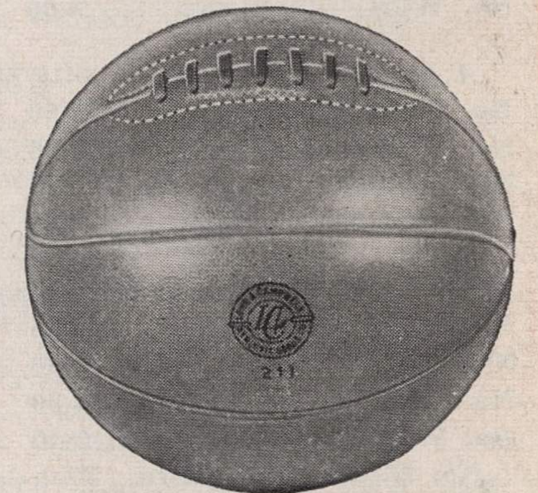
No. B211—"Welt Seam"

No. B234—Official Laceless ball with special graded cowhide cover; double lined and has a patented leak-proof rubber valve. A good durable ball that is most economical for practice use. Minimum official size and perfectly balanced. Price.....$11.50 $8.65