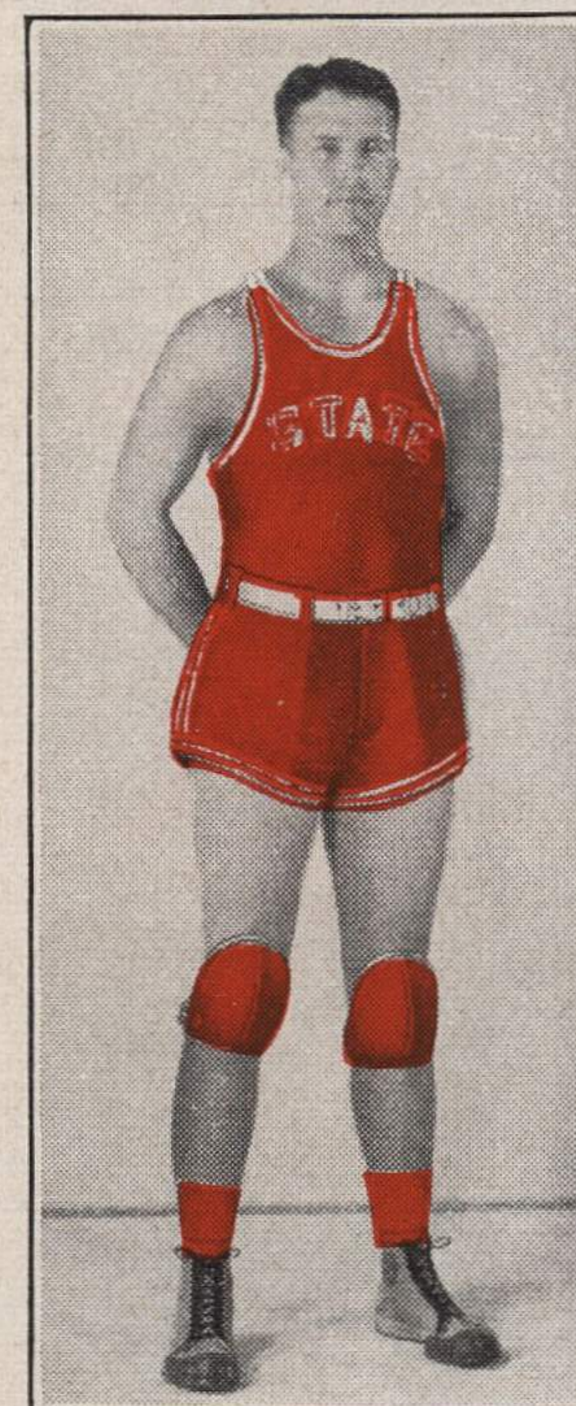
Style "T" Shirt One-Color Trim (Extra 30c)