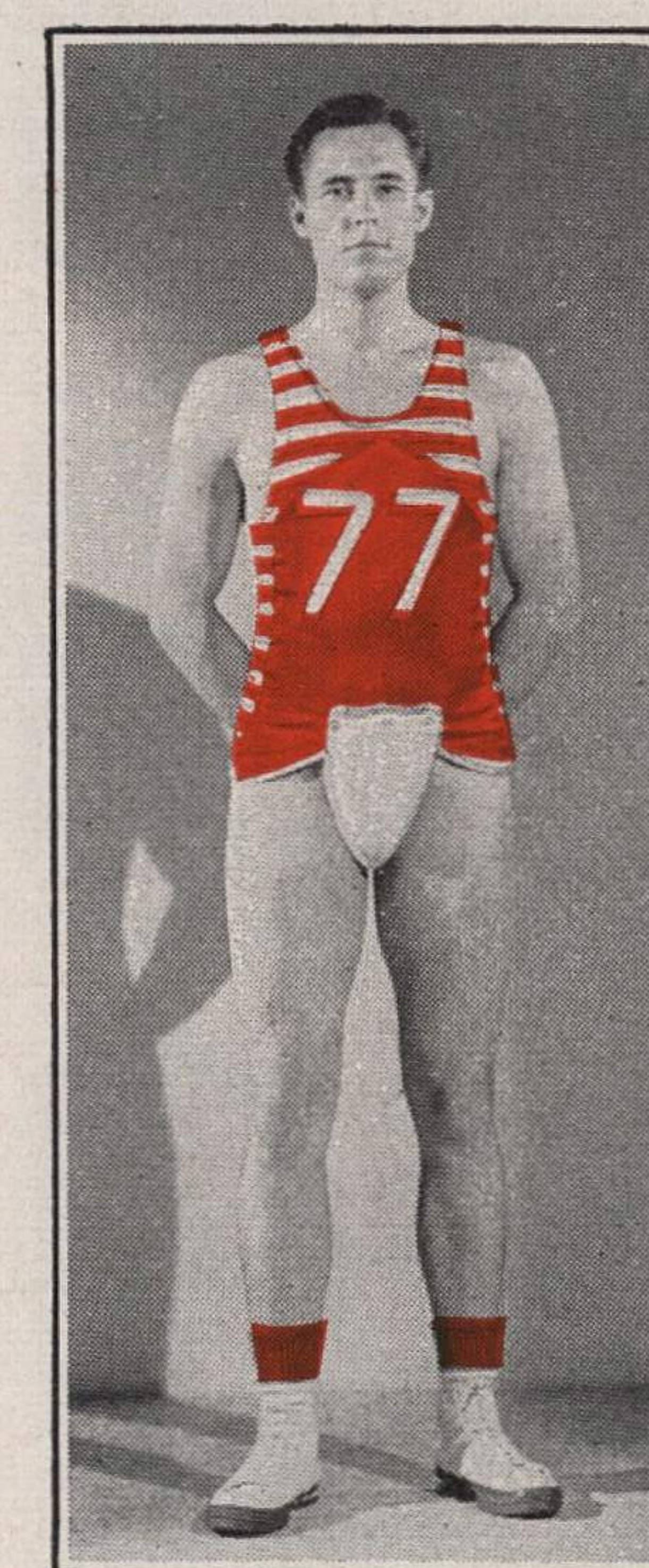
Detachable Supporter On Satin Shirts (Extra 30c Net)