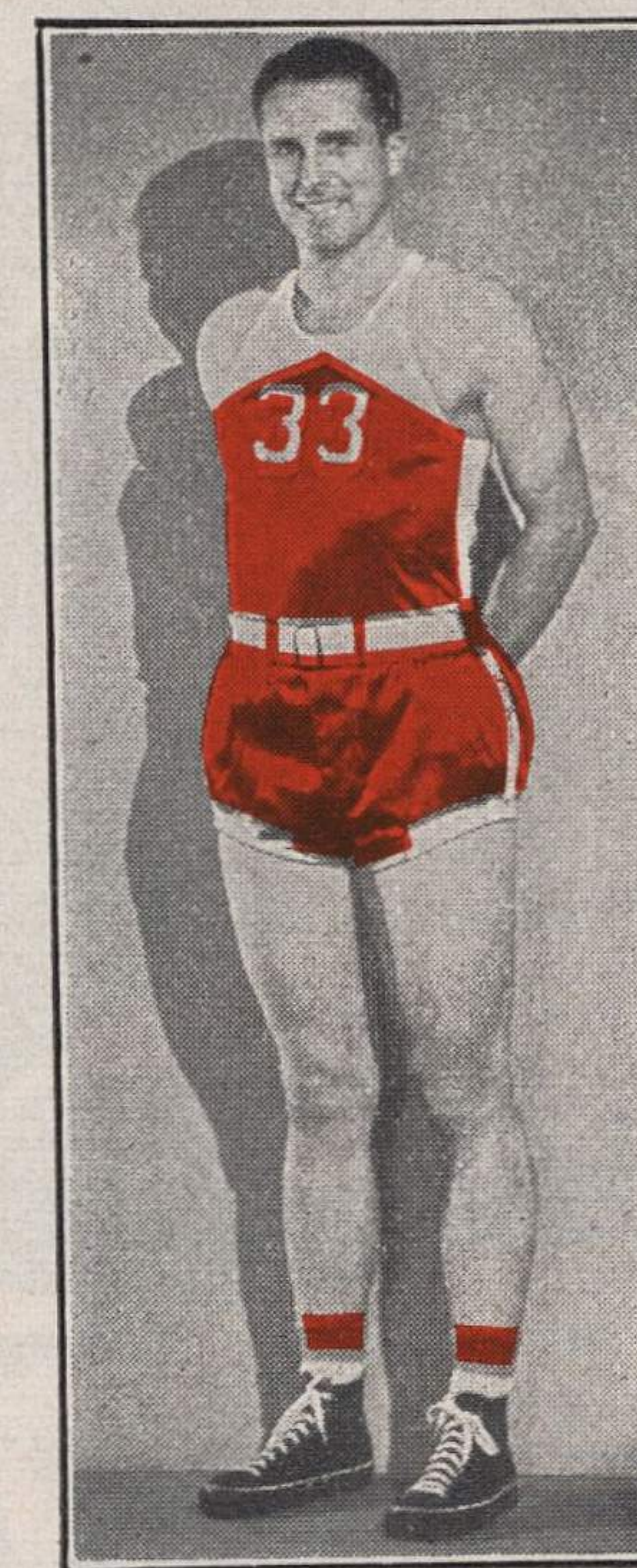
No. B178—Jockey Satin Style "J" Shirt Plain Inserts