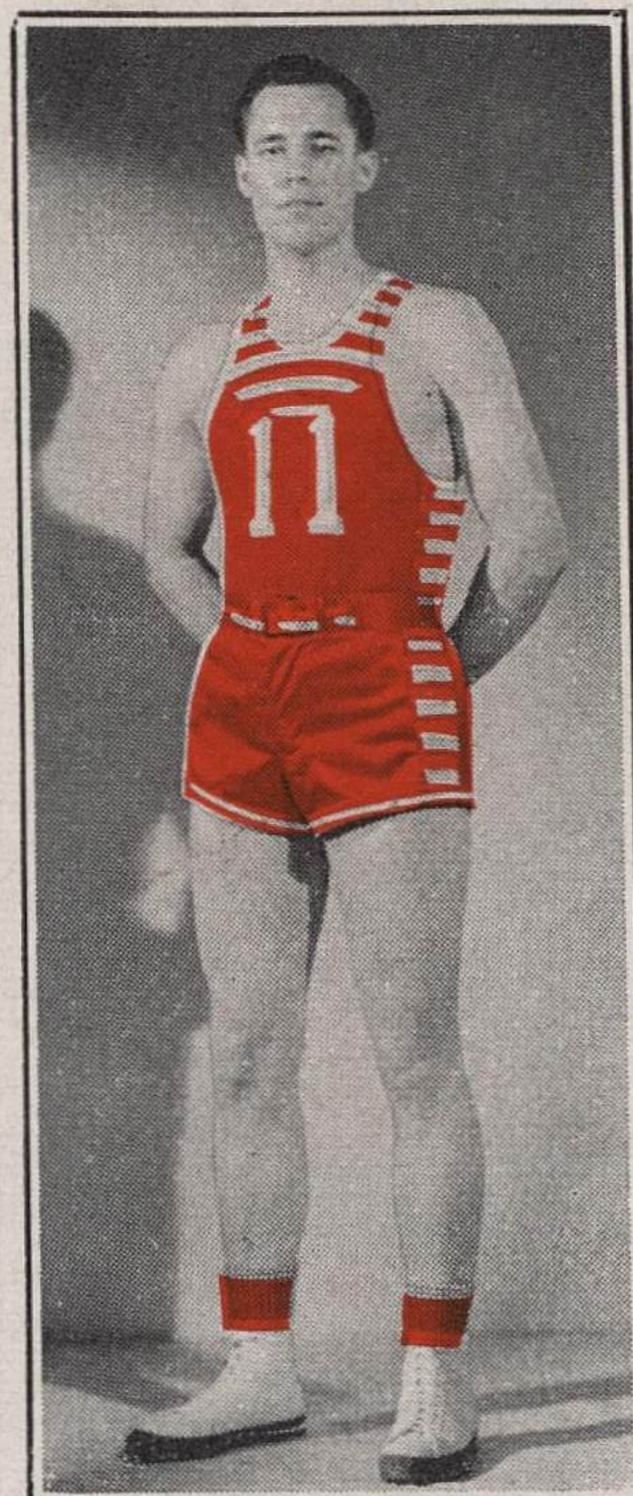
Style "S" Shirt Knit Body Two-Color Knit Inserts