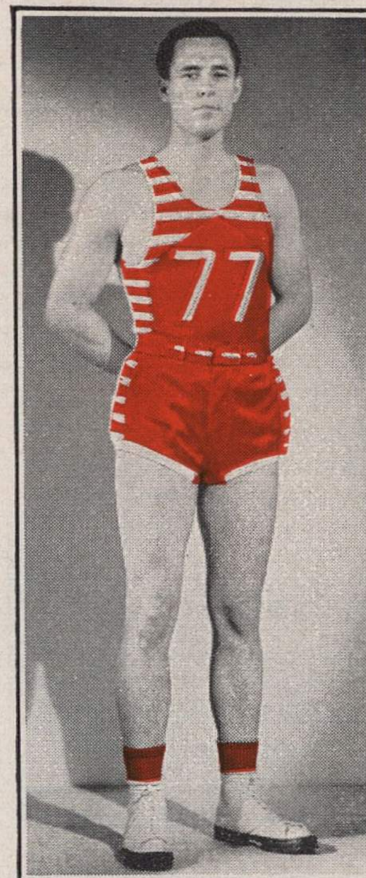
No. B178—Jockey Satin Style "JS" Shirt Striped Inserts (Extra 35c)