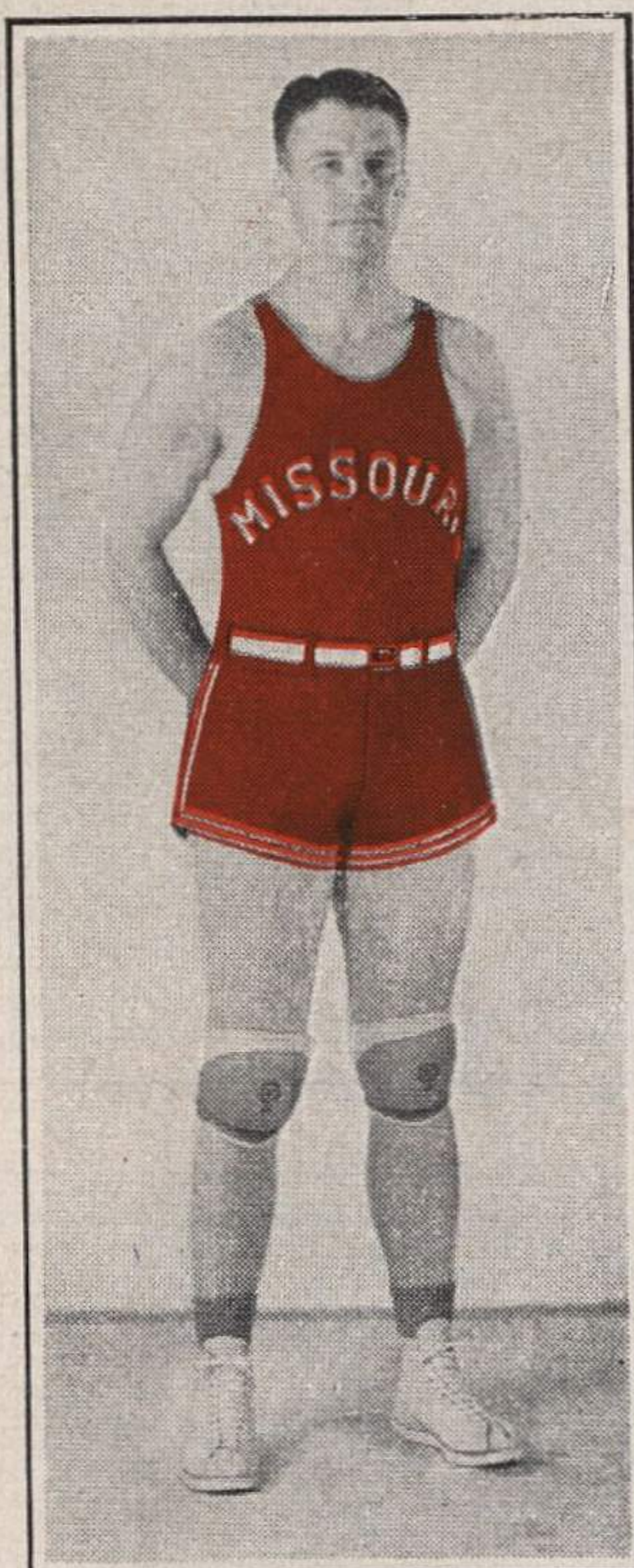
Style "R" Shirt Round Neck (Other Styles Extra)

No. T256—Same as above except white only. Sizes in stock, 22 to 44. Style R.....50c 35c