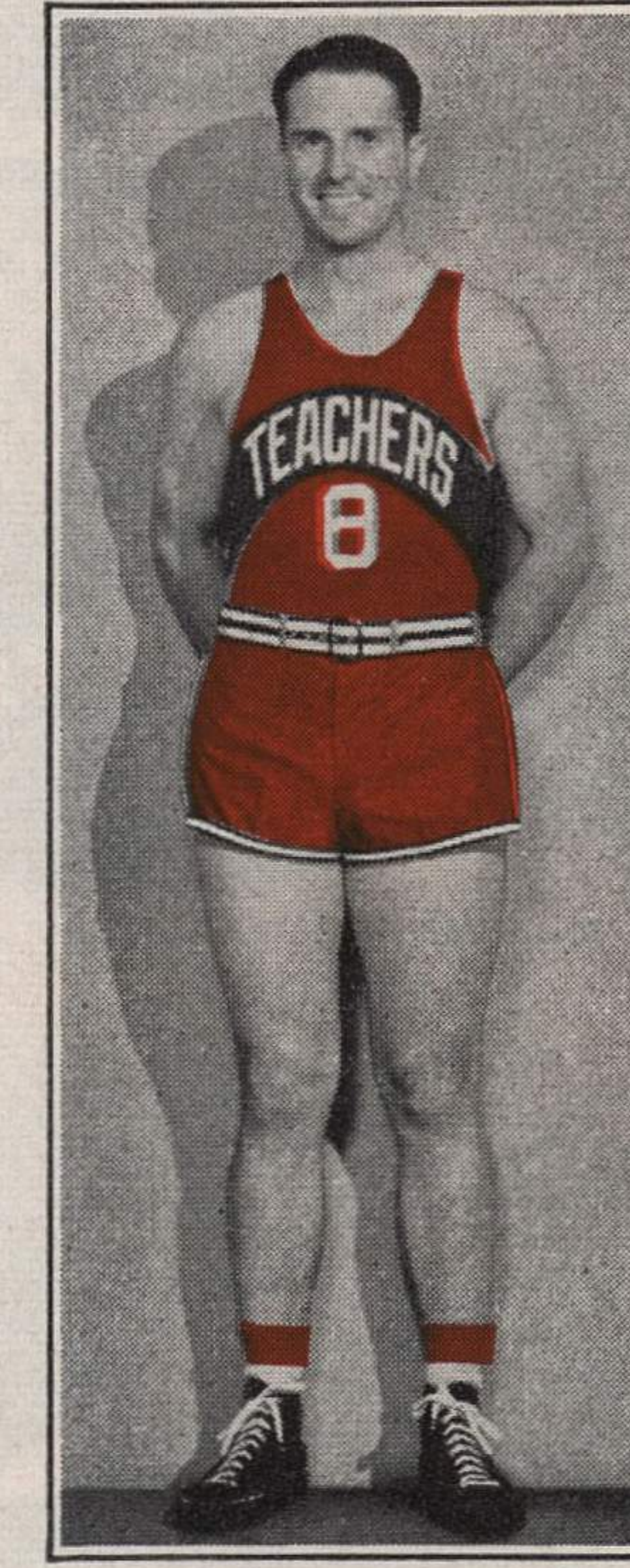
Style "A" Shirt Arched Chest Stripe (Extra 35c)

Wholesale Team Prices Shown In Red Do Not Include Postage