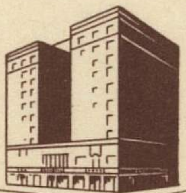
CORNHUSKER LINCOLN, NEBR.