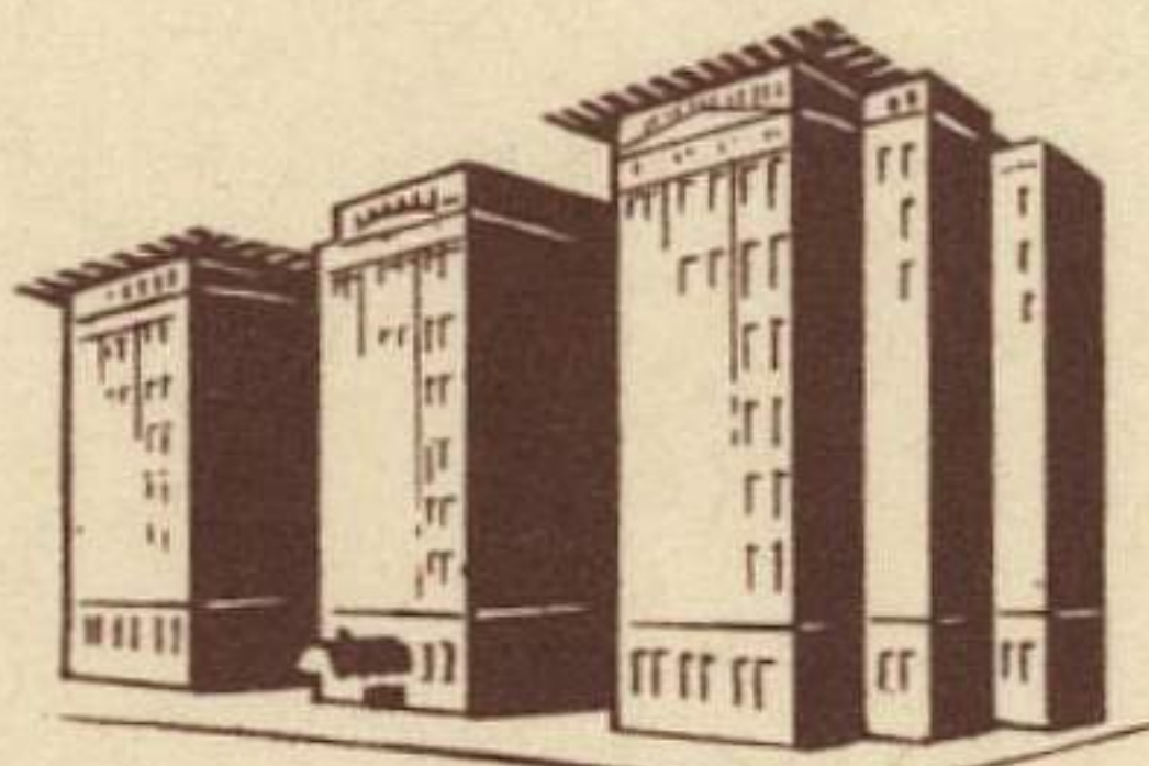
BLACKSTONE OMAHA, NEBR.