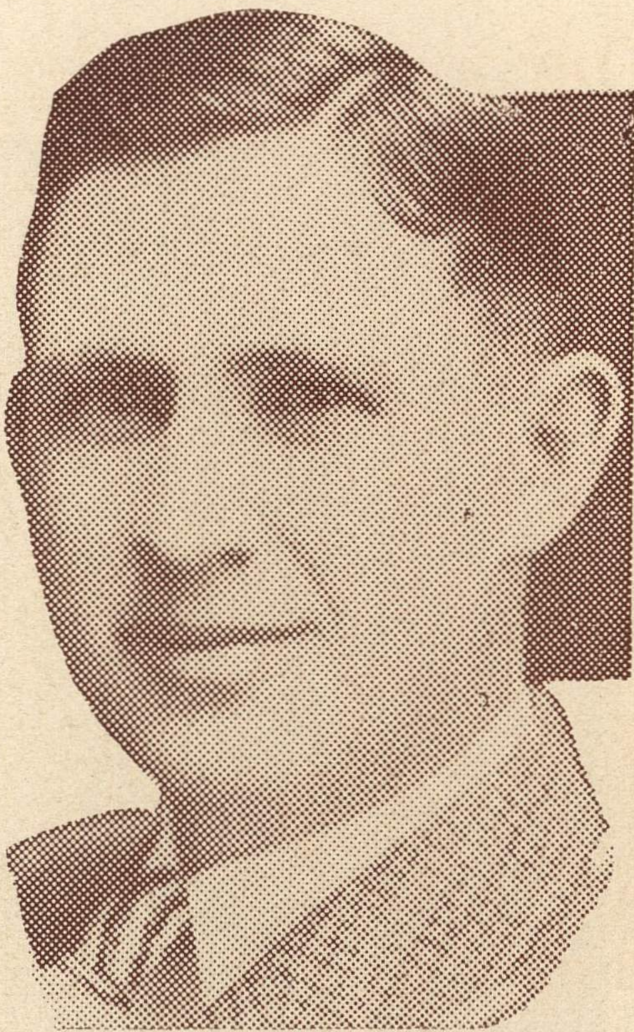
DR. F. C. "PHOG" ALLEN UNIVERSITY OF KANSAS

"Phog" Allen, Director of Athletics and Basketball Coach at the University of Kansas; Chairman of the National Basketball Rules Committee from the Fifth District; a member of the Olympic Committee representing the National Basketball Coaches Association; and famed psychologist in the coaching field, will conduct the "basketball school" on July 28, 30, 31 and August 1, 2. In connection with the basketball work, Allen will also give a course on the "Treatment of Injuries." This alone is worth more to any coach than the fee charged for the entire school. On Sunday, July 29, Dr. Allen will lead a round table discussion on "rules" which is open to the public—one of the additional features of the school.