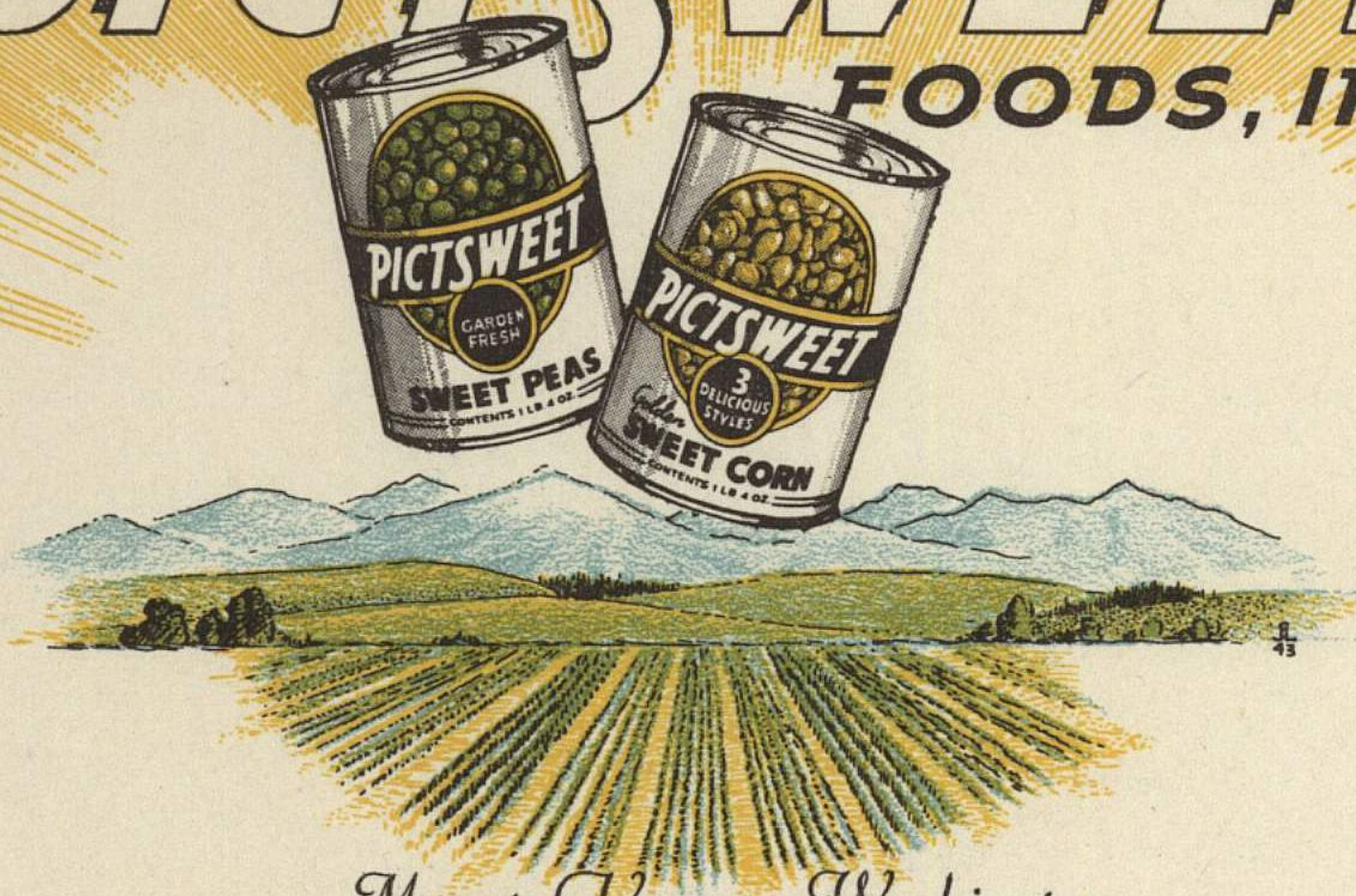
Mount Vernon, Washington