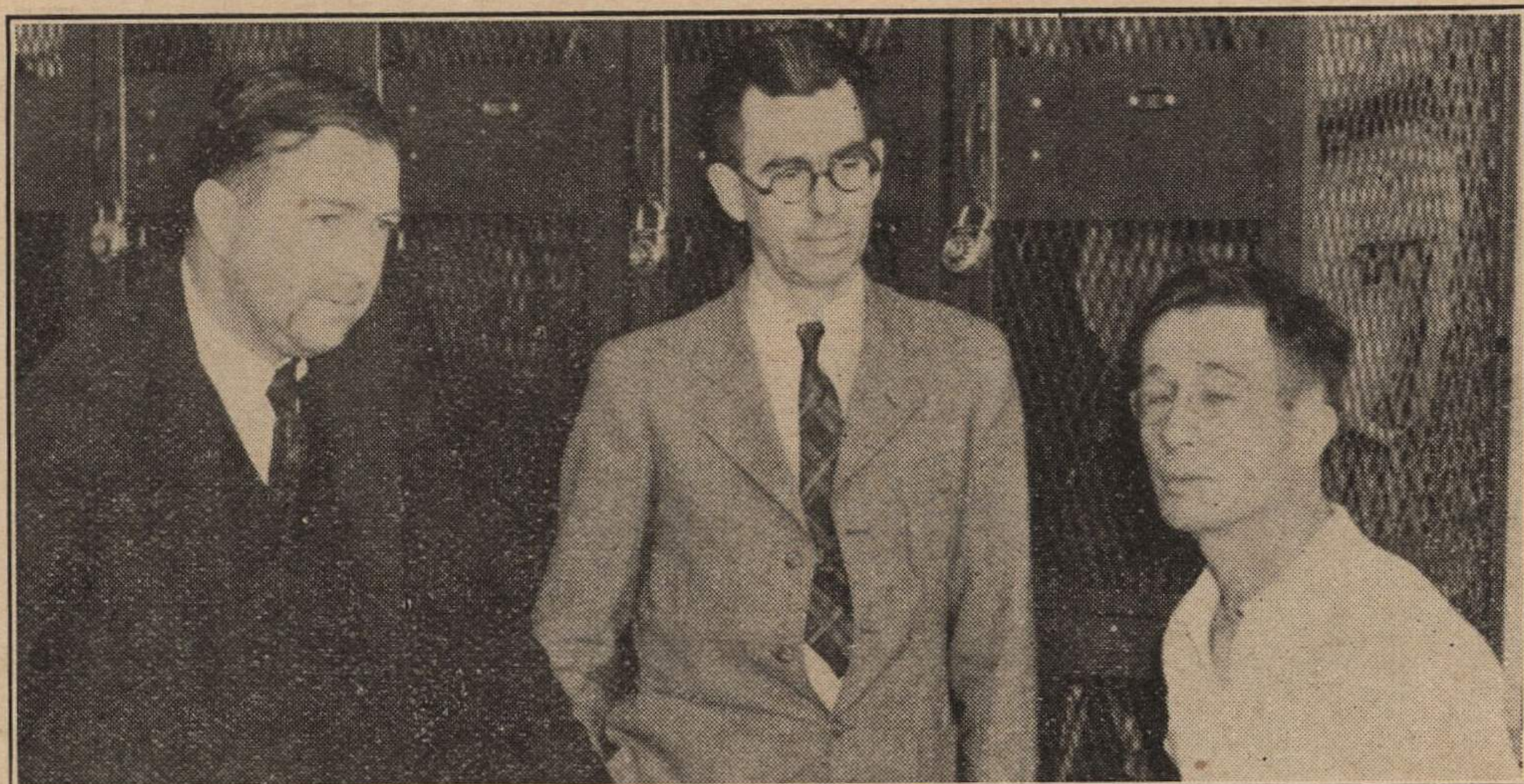
Centenary College Training Room