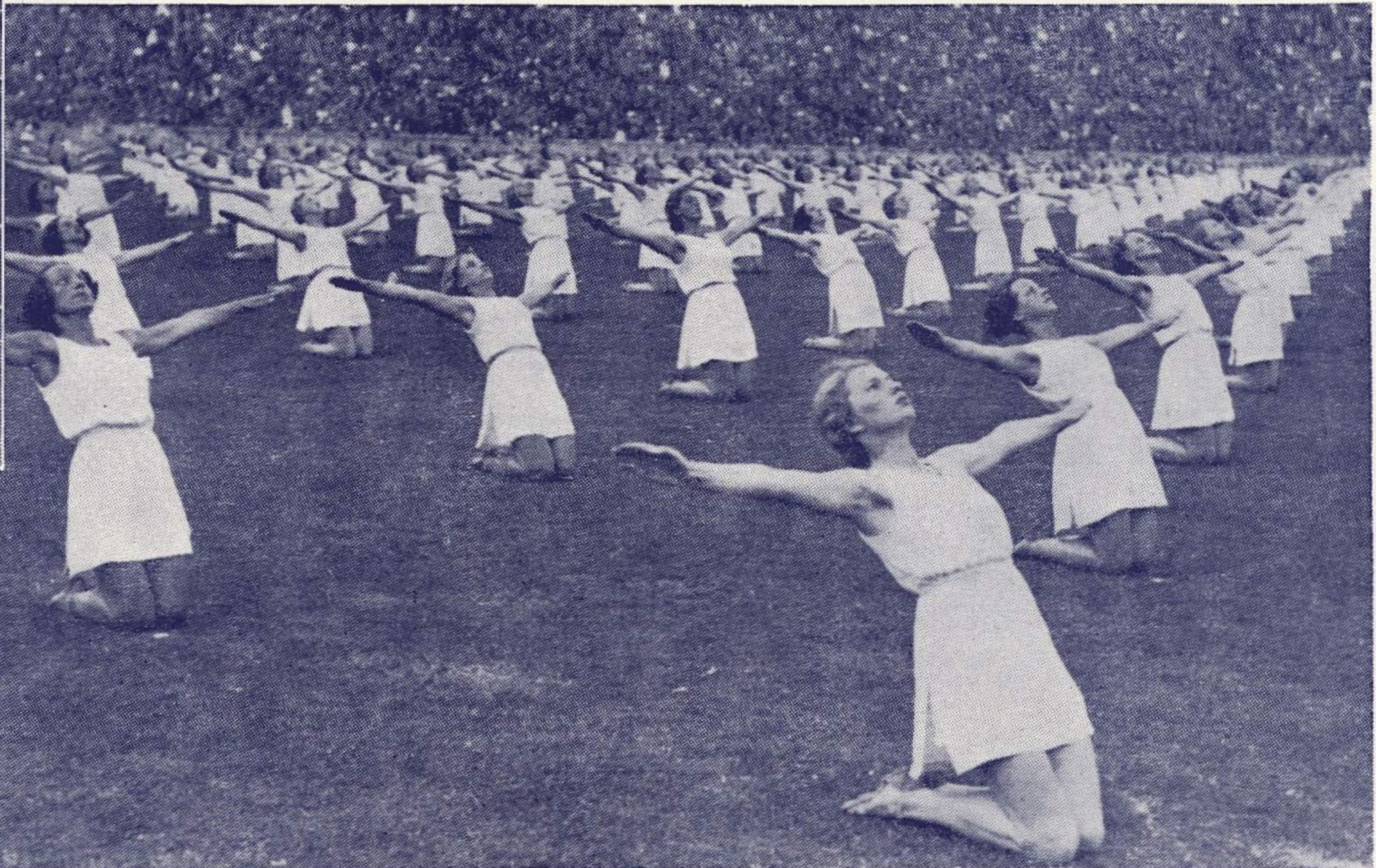
At the Berlin Olympiad 1936 a demonstration was given by 1,200 Swedish gymnasts (600 male and 600 female) before 100 000 spectators who filled the Stadium. The exhibition evoked much interest and attention