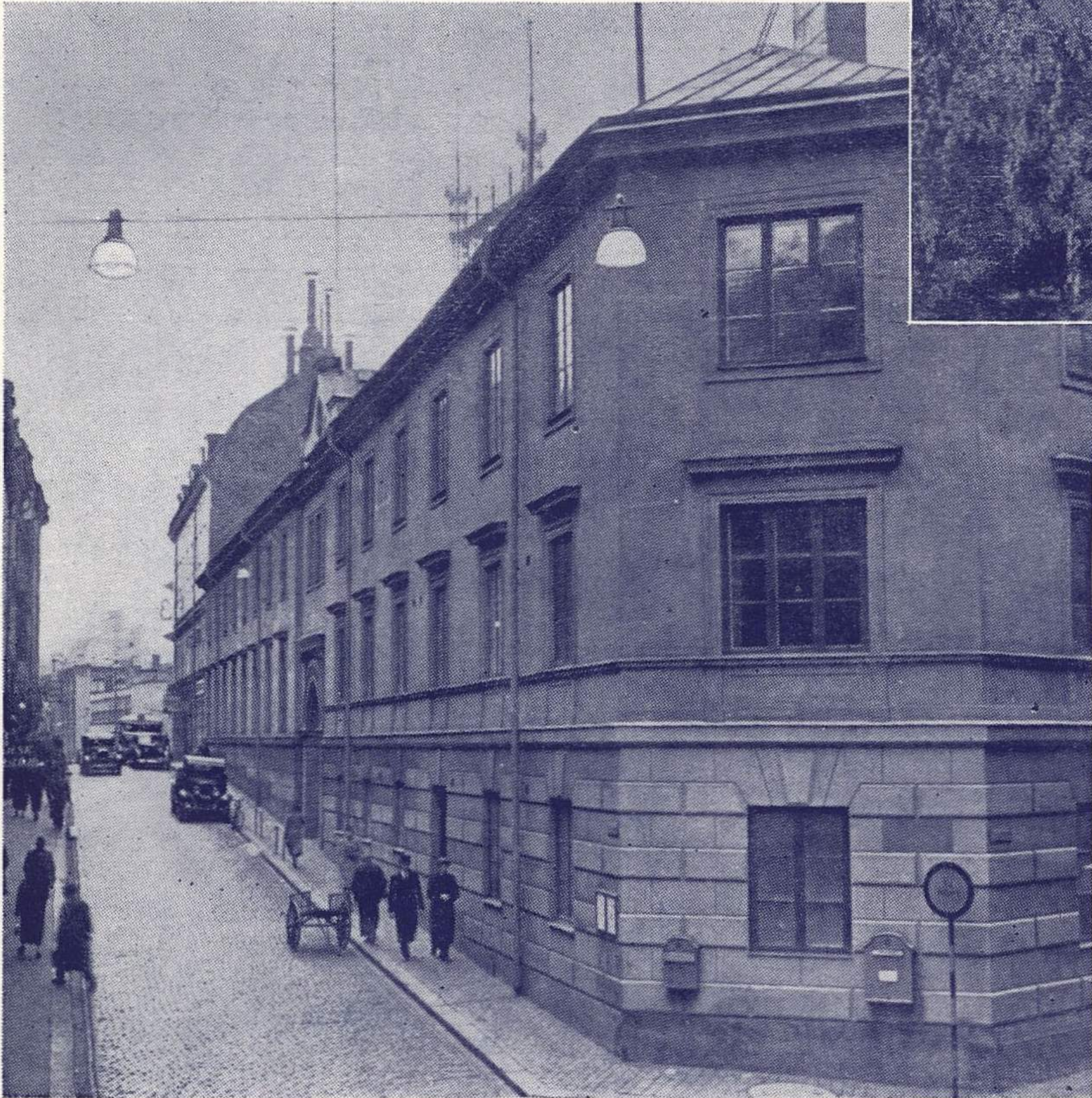
The Royal Gymnastic Central Institute, founded by Ling in 1813