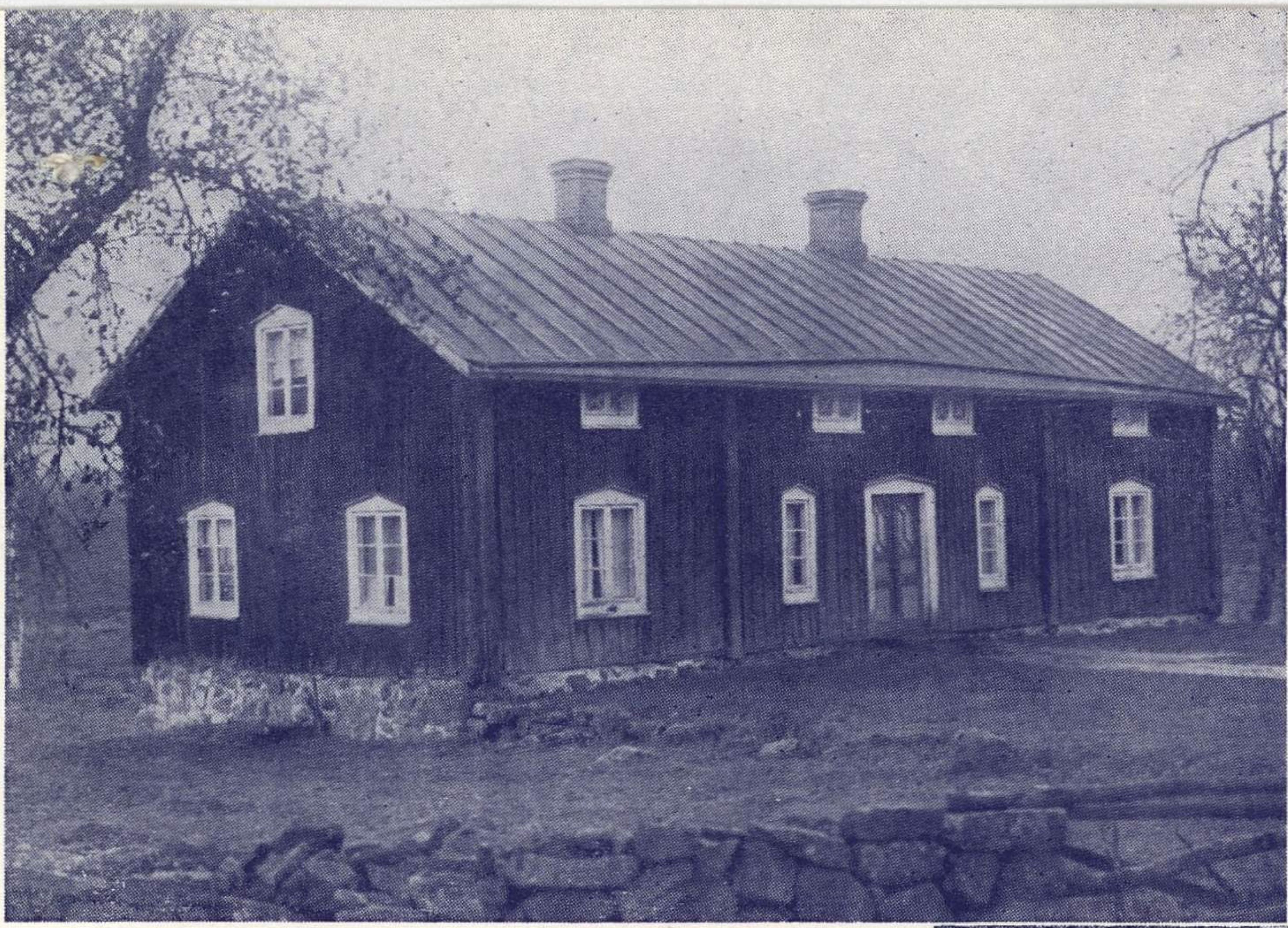
Ling's birthplace at Södra Ljunga, in the county of Småland, which will be moved to its original site and restored for the centenary celebration