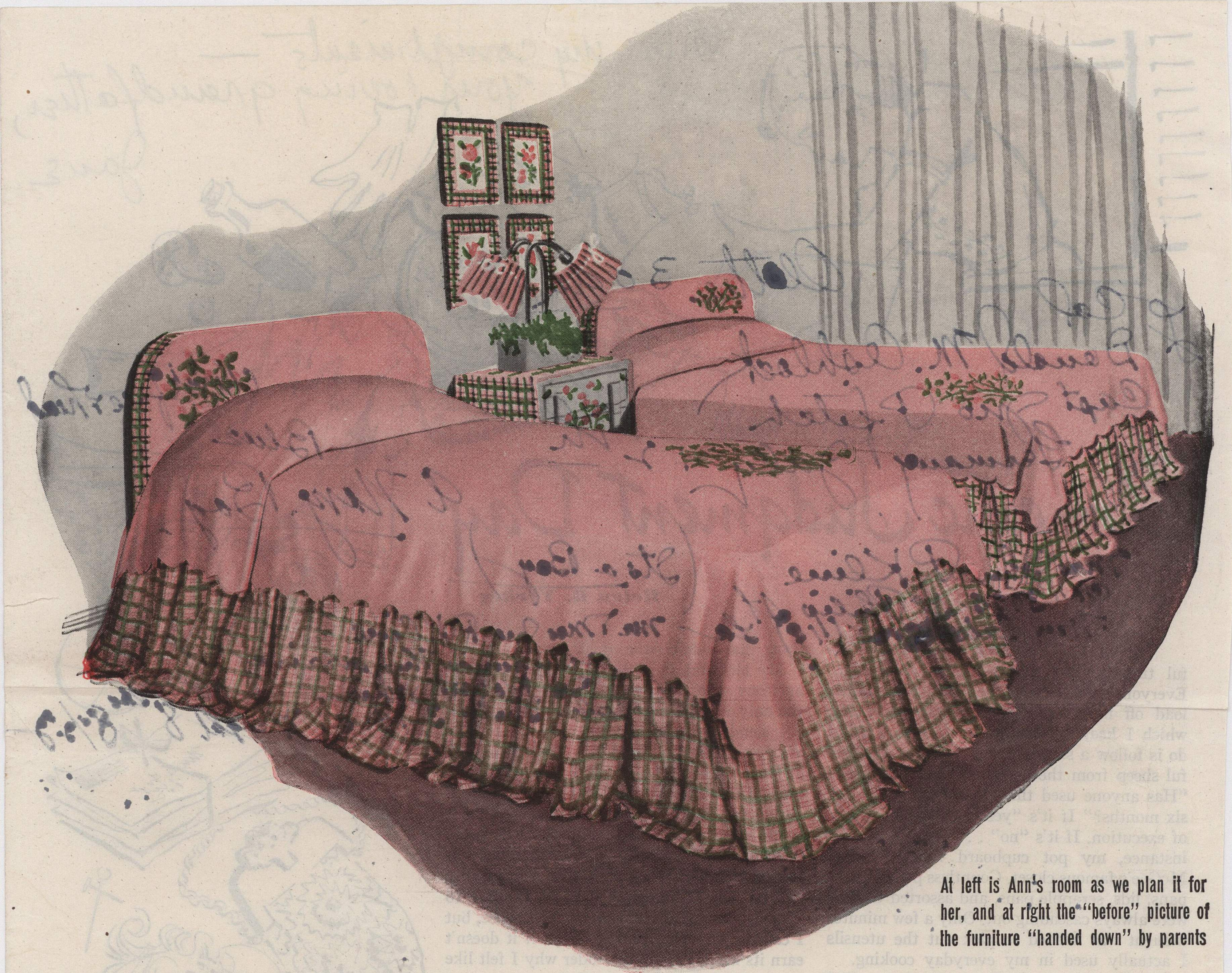
At left is Ann's room as we plan it for her, and at right the "before" picture of the furniture "handed down" by parents