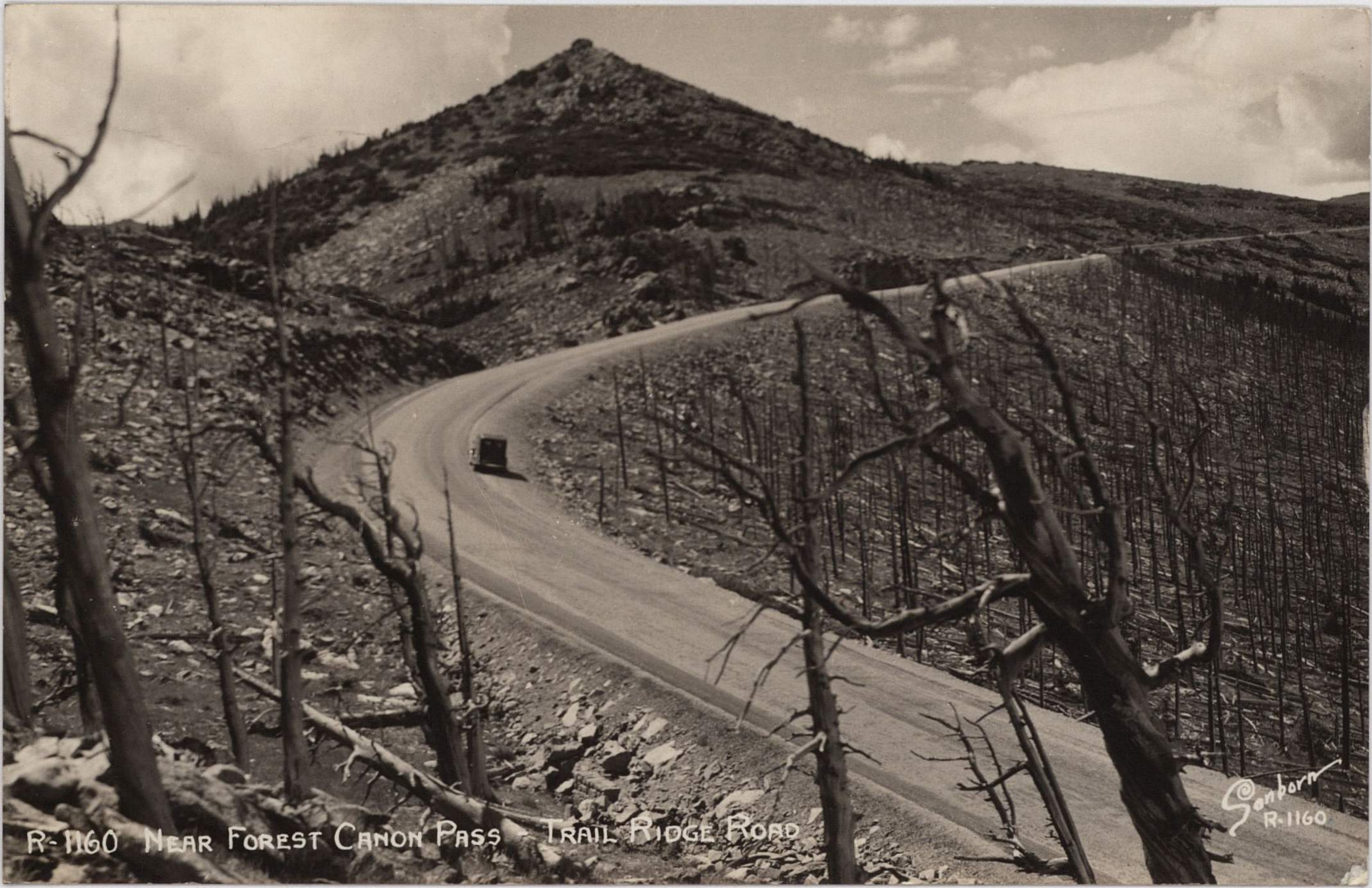
R-1160 NEAR FOREST CANON PASS - TRAIL RIDGE ROAD