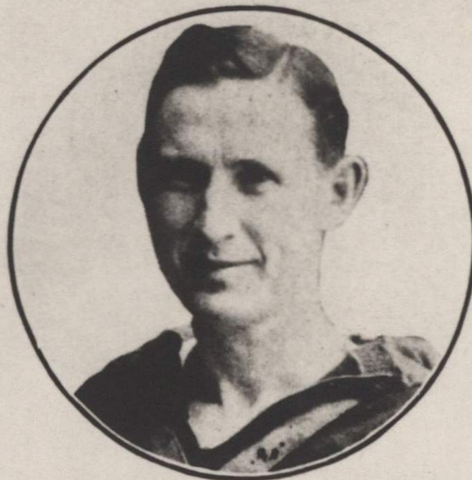
DR. FORREST C. ALLEN Athletic Dir. and Basket Ball Coach, University of Kansas

THE "PHOG" ALLEN BASKET BALL WAS THE OFFICIAL BALL OF THE 1927 NATIONAL A. A. U. CHAMPIONSHIPS