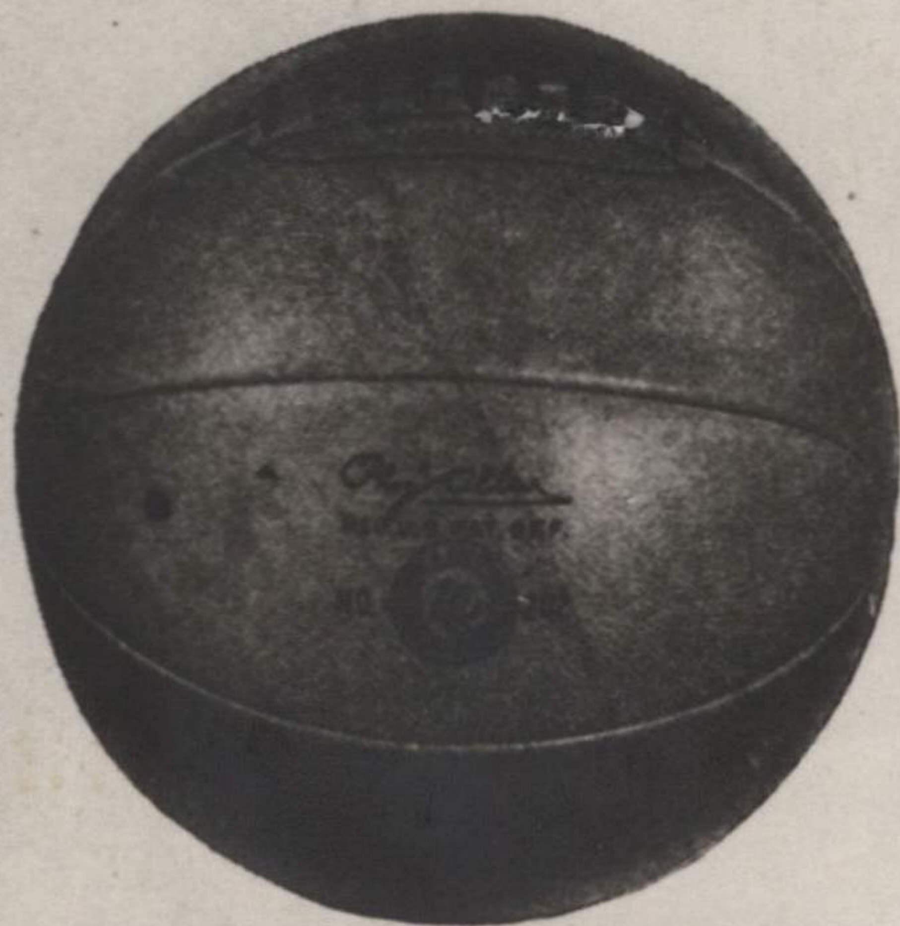
No. 202—"Phog" Allen Official Intercollegiate Basket Ball

THE "PHOG" ALLEN BASKET BALL WAS THE OFFICIAL BALL OF THE 1927 NATIONAL A. A. U. CHAMPIONSHIPS