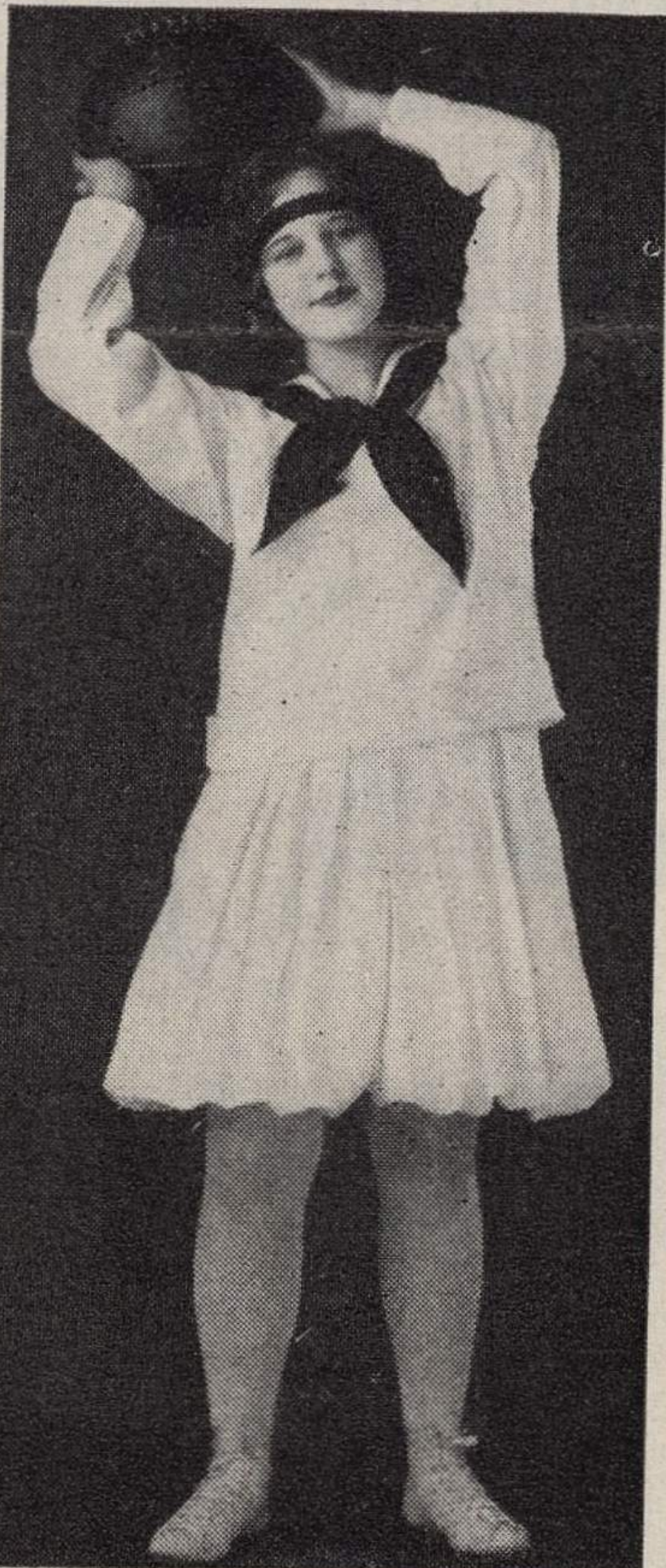
Sally Rand, as she appeared in a Lowe & Campbell Gym Suit, DBF. (Days Before Fans).

A product of Kansas City, also the location of our home office, Billy Beck, now everywhere known as SALLY RAND, proved that "the fan is quicker than the eye." For several years she appeared in our catalogs attired in the latest fashions of girls' gymnasium and basket ball clothing, class caps, and similar sports wear. Shown the pictures recently, she readily identified them as "genuine" in spite of the contrast of her more modern costumes.