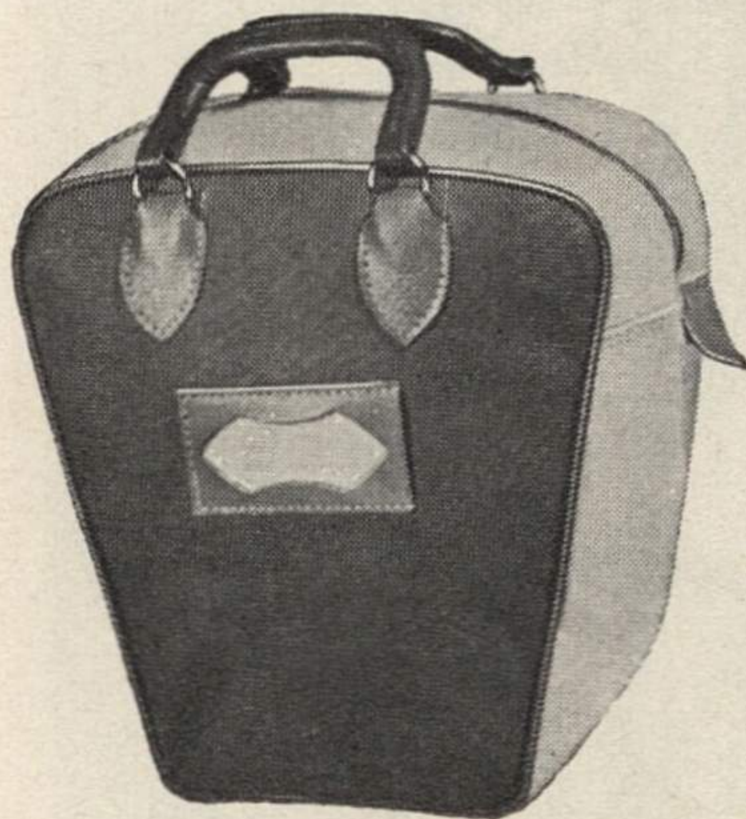
No. G570—Shu-Ball Bag