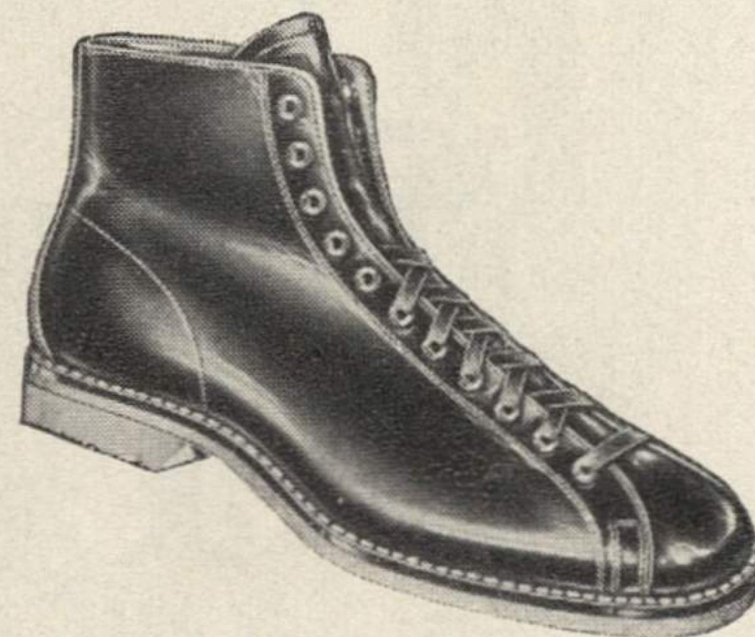
No. G591—Bowling Shoe

Blouses, Skirts and Slacks Made To Order