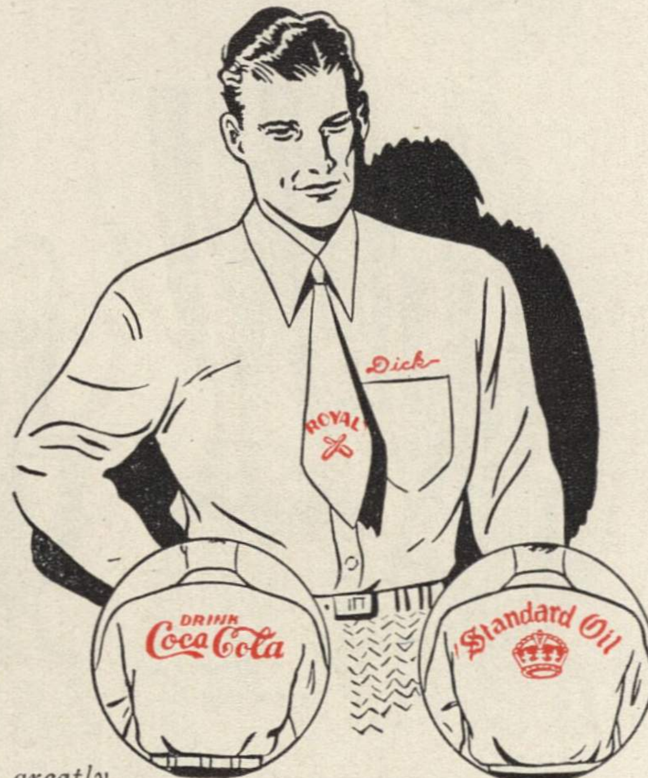
Bowling Shirt and Lettering

No. G573—Leather Carry-All. De luxe bag of black elk leather; zipper top and double handles. Card holder; studded bottom. Removable ball retainer. Price.....$8.50 $6.30