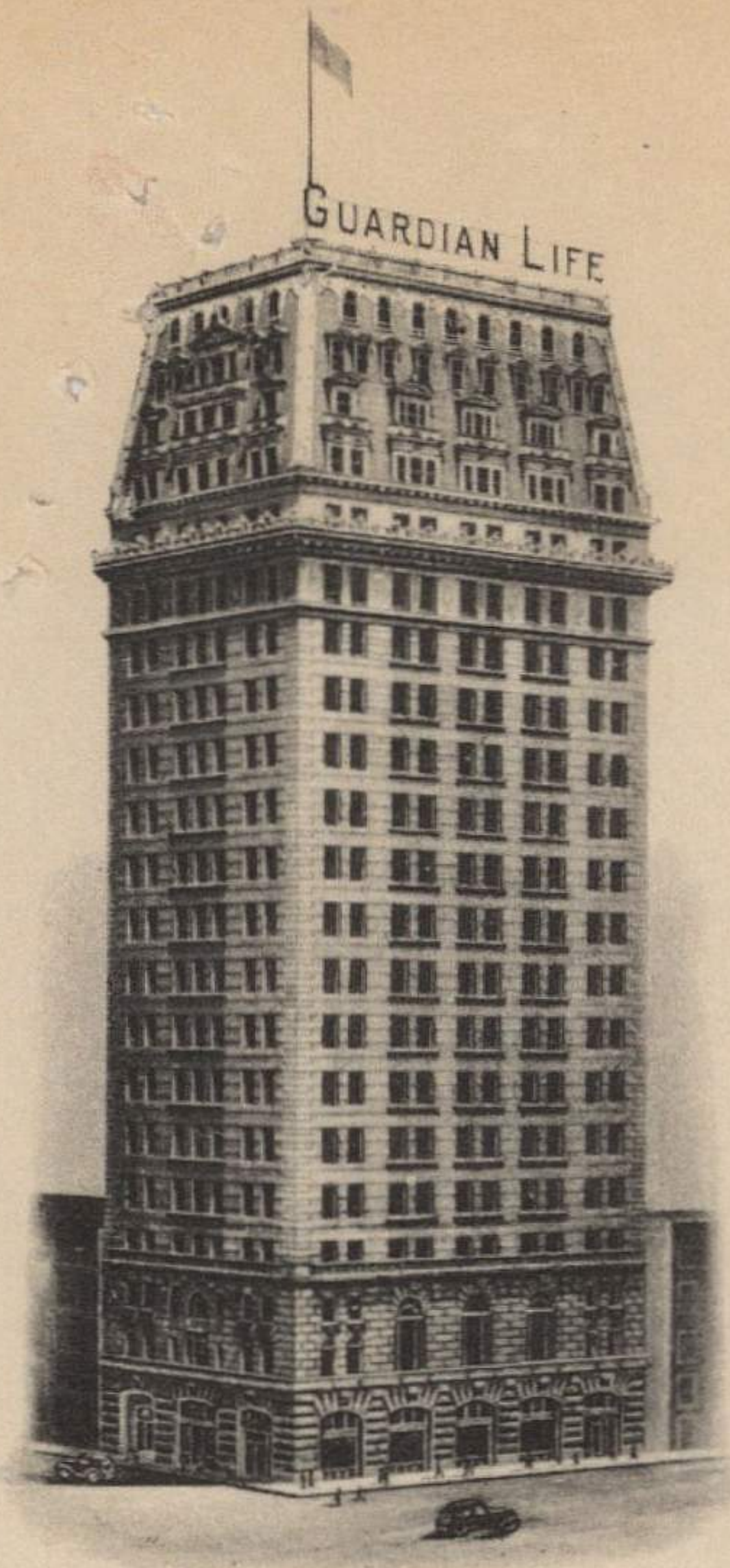
HOME OFFICE BUILDING 50 UNION SQUARE, NEW YORK