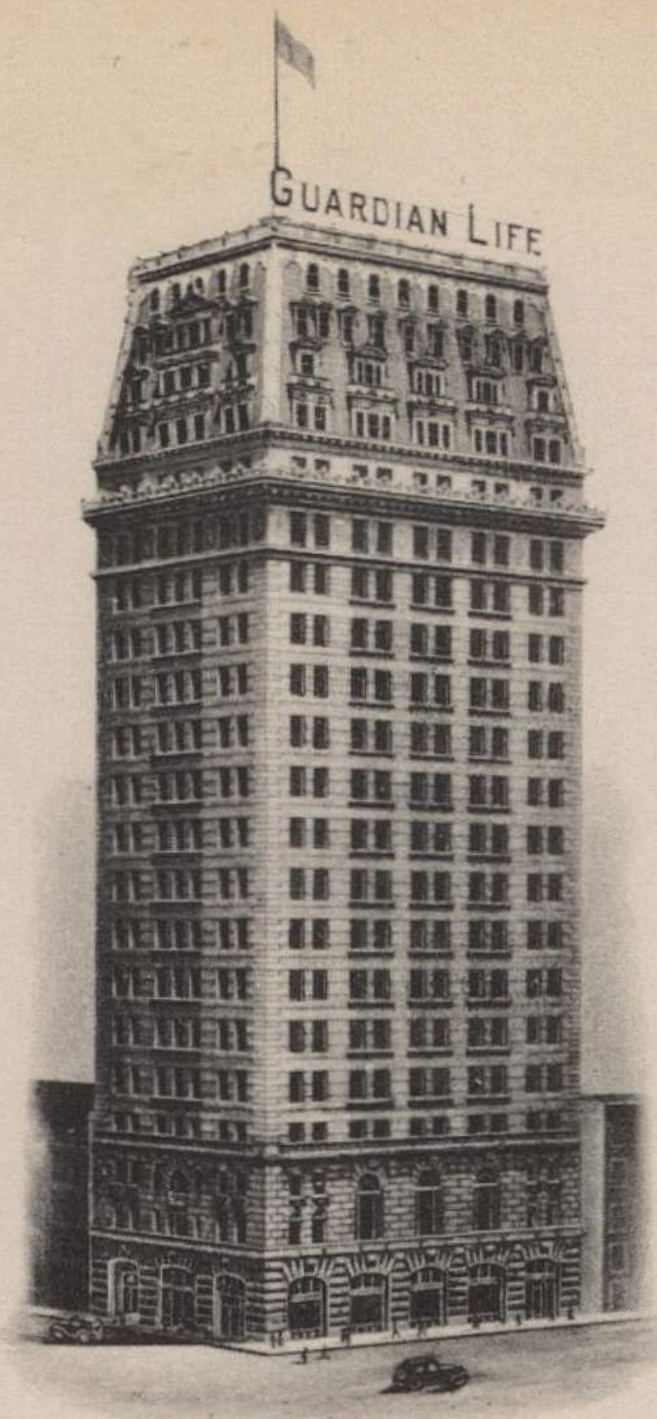
HOME OFFICE BUILDING 50 UNION SQUARE, NEW YORK