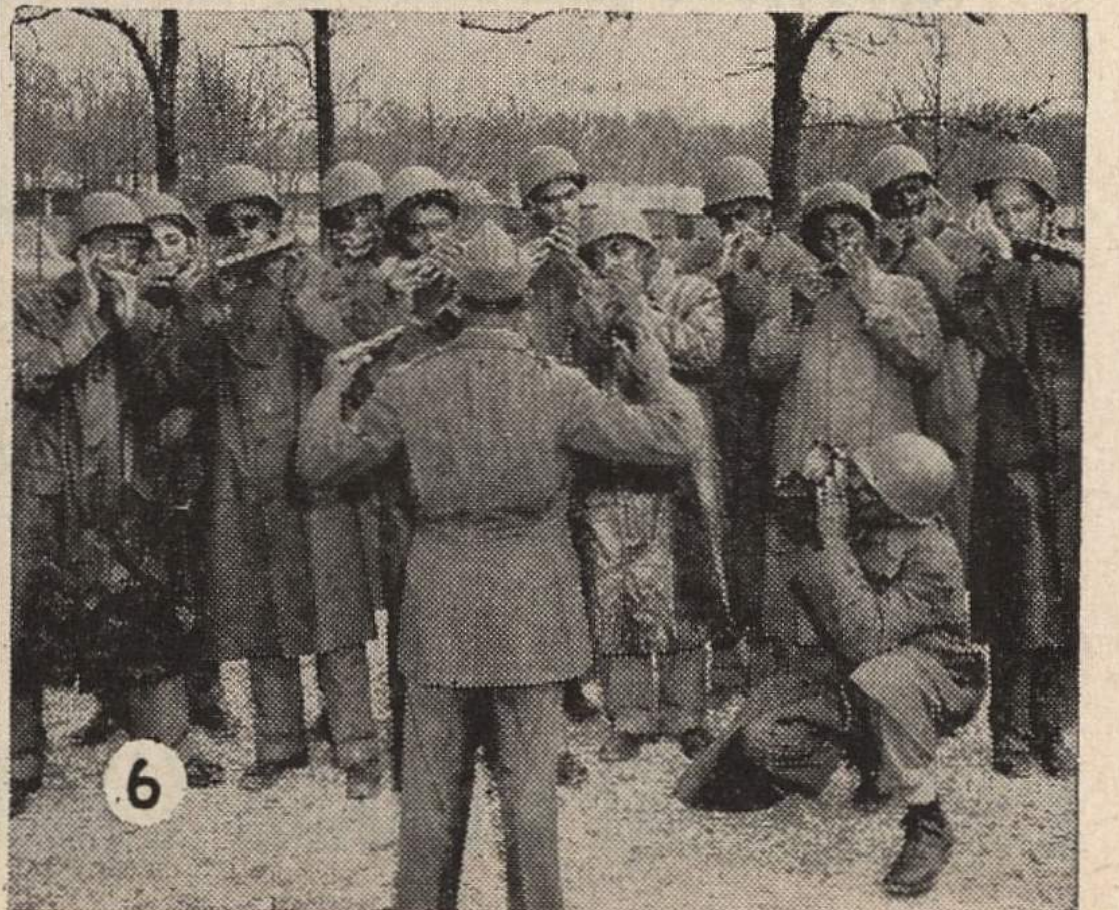
1. U. S. attack on Italian melons offered by Red Cross girl. 2. Red Cross workers equipped for overseas duty. 3. and 4. Red Cross hospital workers "take a letter" for a sailor and a soldier. 5. Red Cross worker assists readers in evacuation hospital library. 6. Harmonicas donated by Red Cross Camp and Hospital Council.