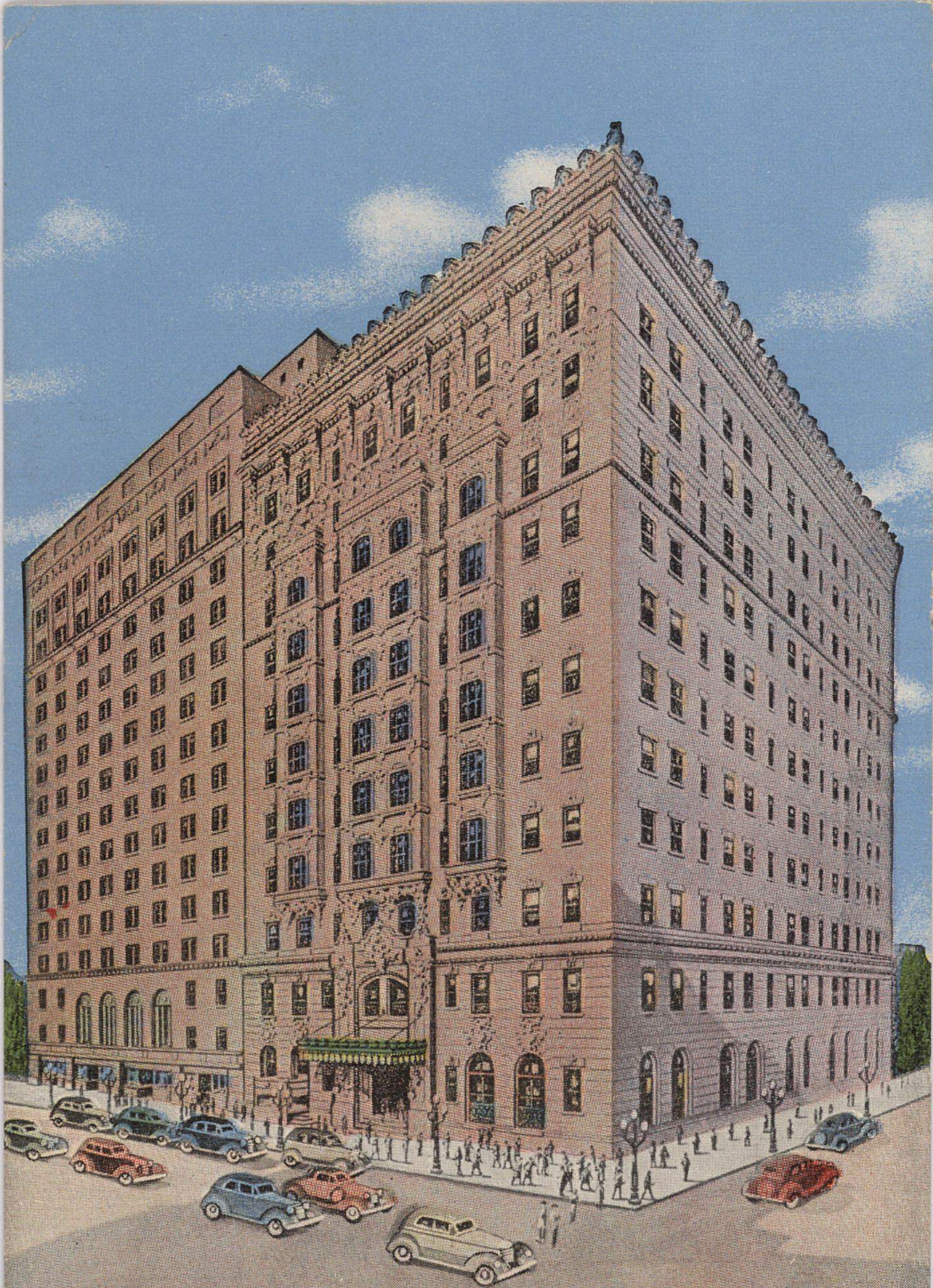
M NEW HOTEL MONTELEONE, NEW ORLEANS M