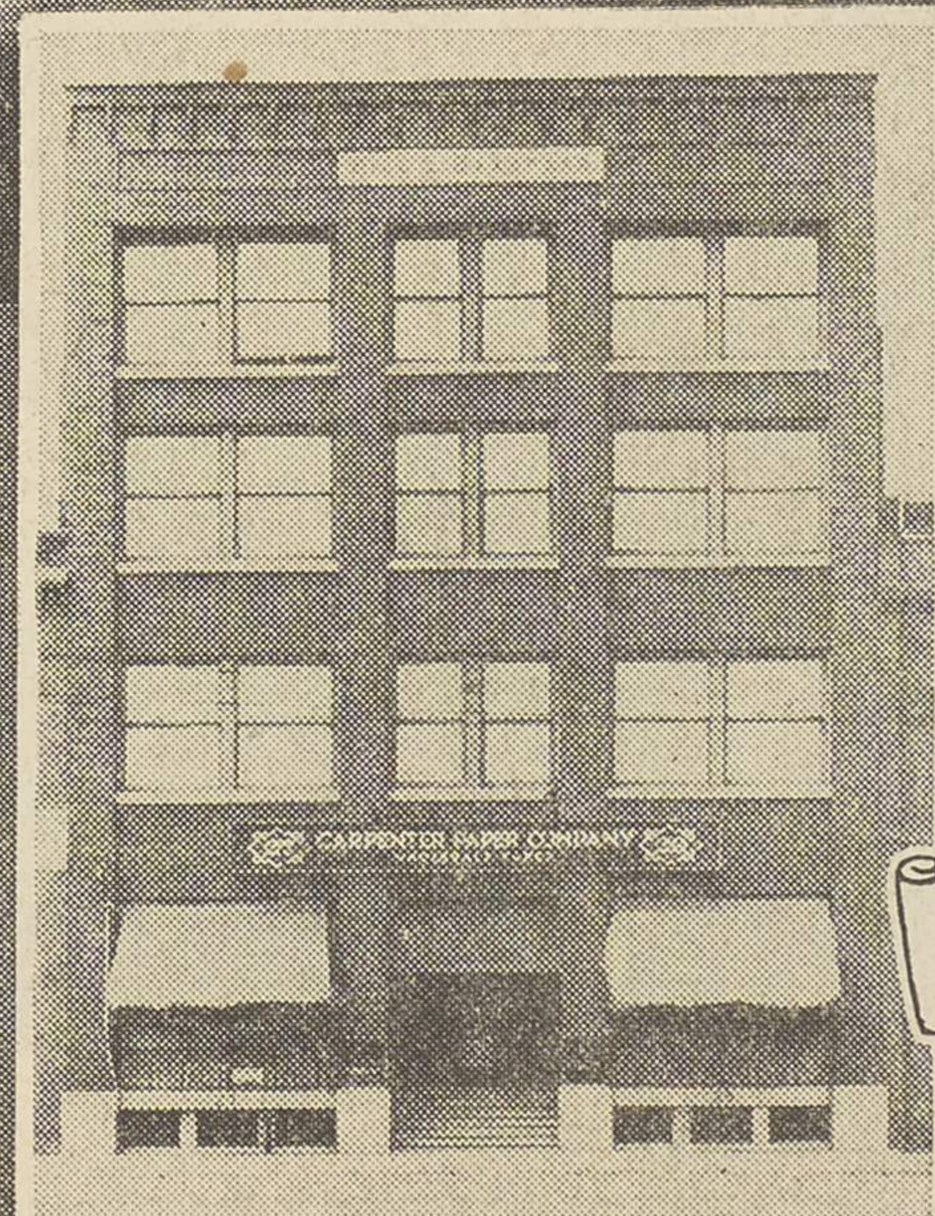
1922 27-29 Grand