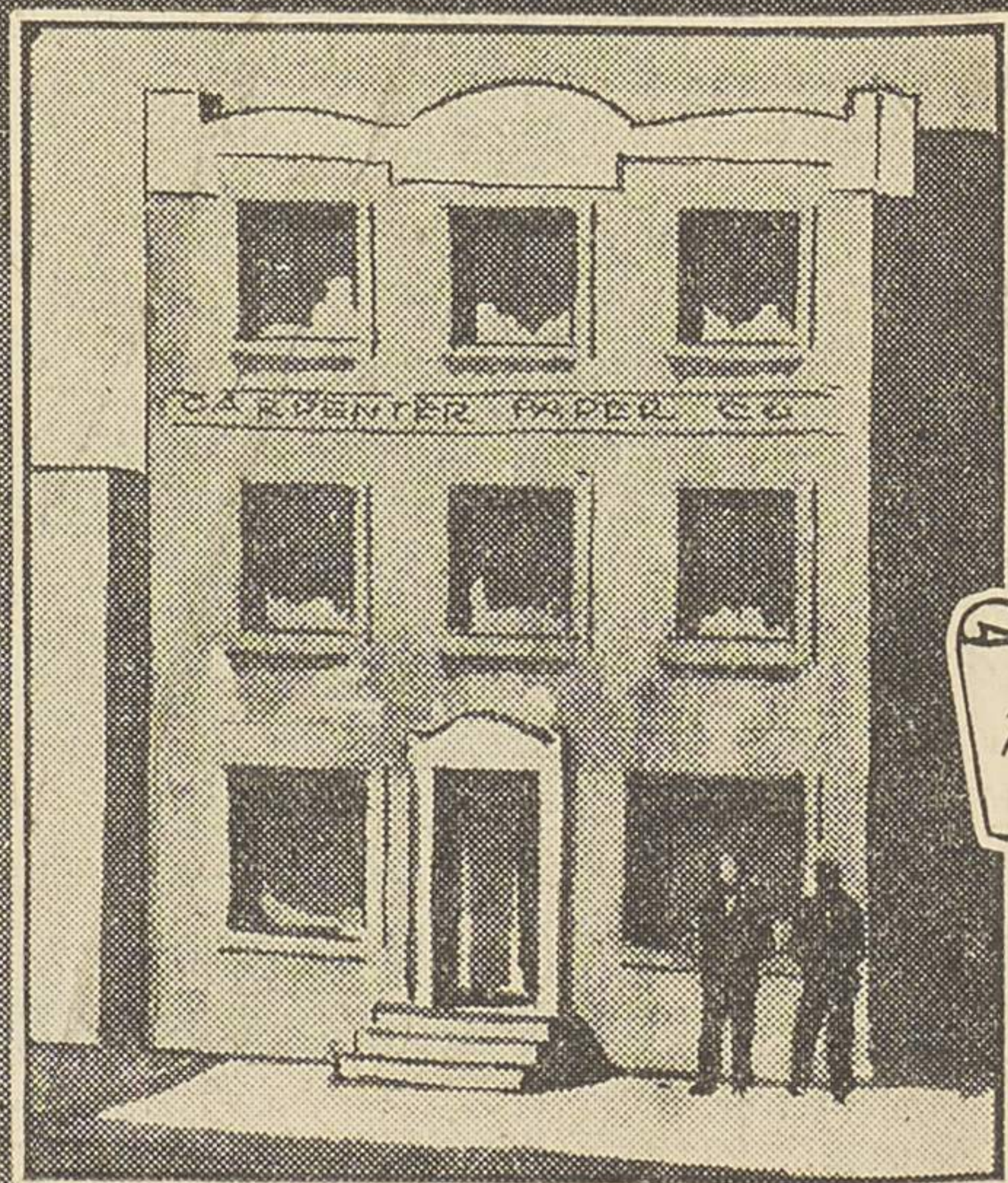
1916 Robinson and First