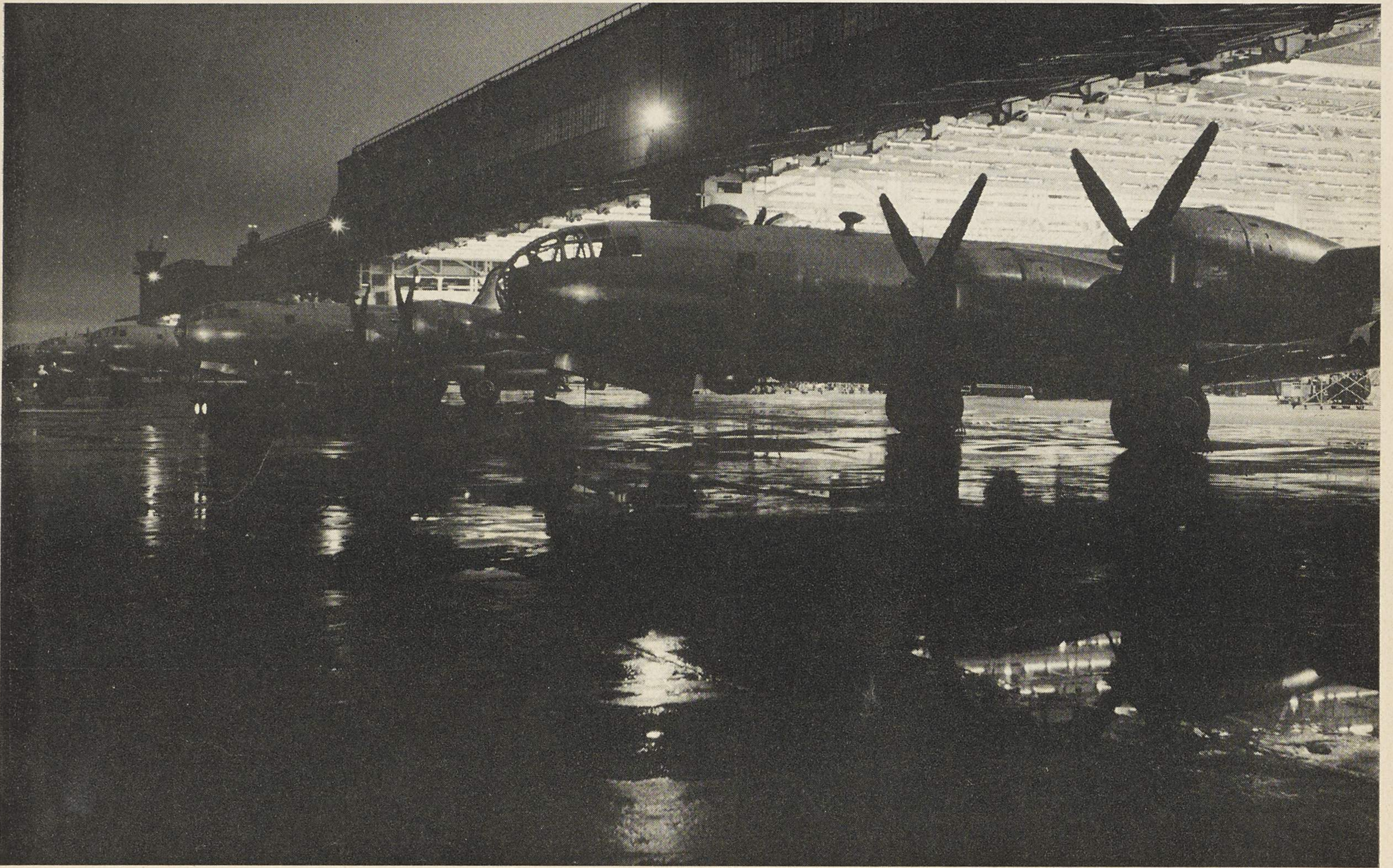
ABOVE: Night and day, B-29 Superfortresses move in steadily growing numbers through the doors of Final Assembly. The wide ramp north of Plant II is filled with B-29's. So is the huge parking apron east of the plant. This view is looking east along the two 300-foot wide north doors of Plant II