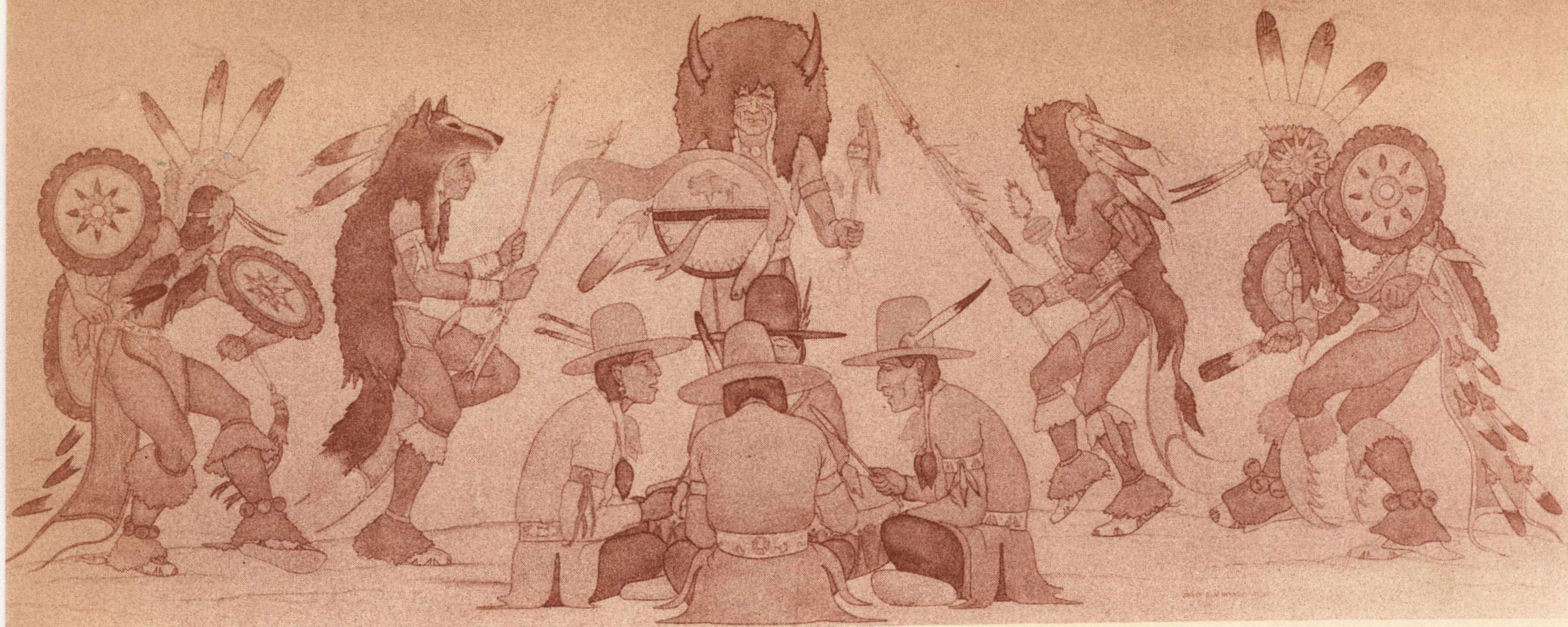
Hand carved mural from lounge of NORMAN COURTS, NORMAN, OKLA.