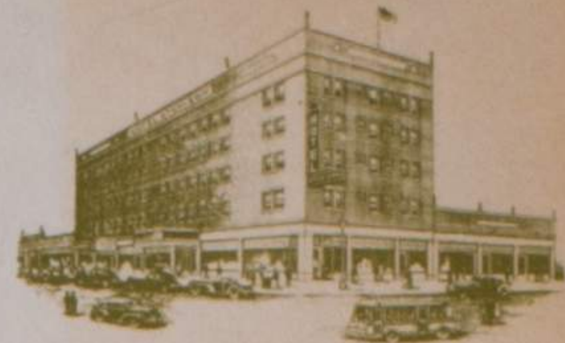
HOTEL ATCHISON ATCHISON, KANSAS