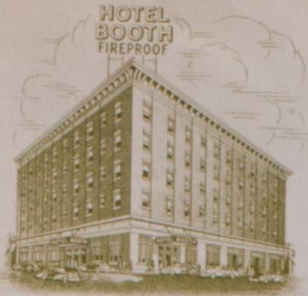
BOOTH HOTEL INDEPENDENCE, KANSAS