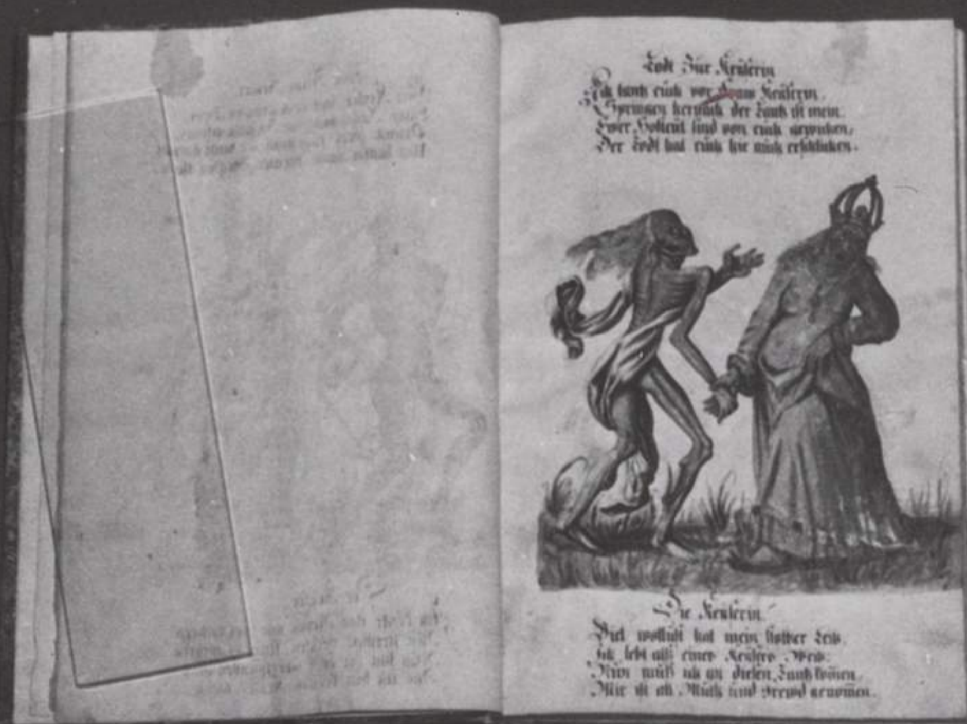
1492 This manuscript was written in the 15th century and is one of the earliest examples of the use of the printing press in the production of books.